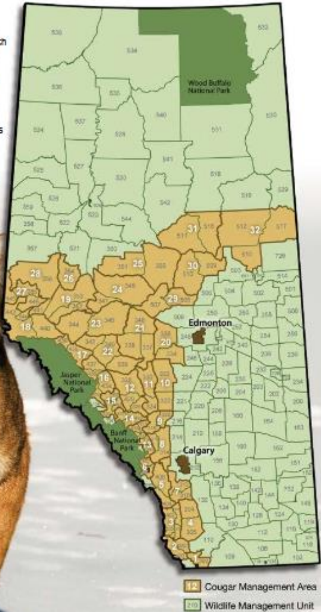
Map taken from page 4 of Cougar Hunting in Alberta Guide , posted to Open Government November 28, 2019