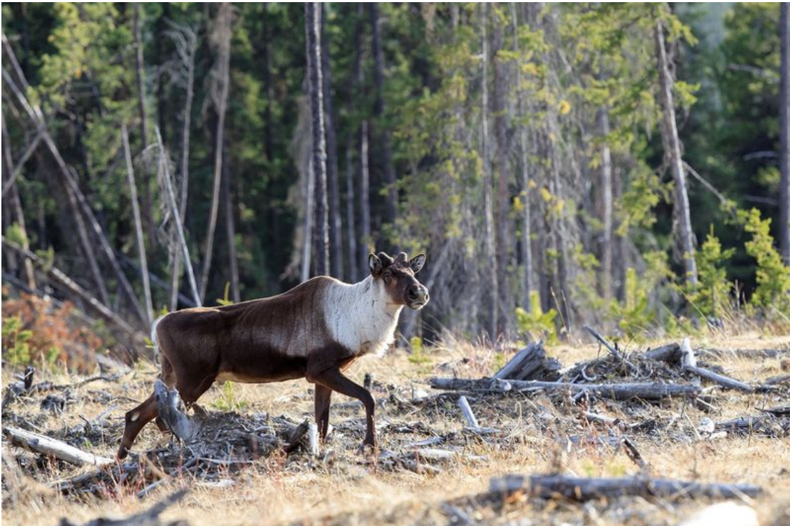
Threatened mountain caribou from the À La Pêche herd near Grande Cache, Alberta.

Conservation groups and trappers have learned that West Fraser Hinton has paused its controversial clearcut logging plan in critical habitat of threatened À La Pêche caribou in west central Alberta. West Fraser's decision follows recent change in direction from the Alberta government to create a temporary 'No Harvest Zone' in undisturbed caribou habitat of the À La Pêche caribou population, until Alberta finishes its land-use plan for the area (see maps). West Fraser's and Alberta's decision follows months of opposition by local trappers, the Mountain Métis community, the conservation community and many concerned Albertans.