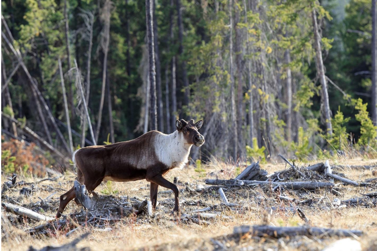
Threatened mountain caribou from the À La Pêche herd near Grande Cache, Alberta.

Conservation groups and trappers have learned that West Fraser Hinton has paused its controversial clearcut logging plan in critical habitat of threatened À La Pêche caribou in west central Alberta. West Fraser's decision follows recent change in direction from the Alberta government to create a temporary 'No Harvest Zone' in undisturbed caribou habitat of the À La Pêche caribou population, until Alberta finishes its land-use plan for the area (see maps). West Fraser's and Alberta's decision follows months of opposition by local trappers, the Mountain Métis community, the conservation community and many concerned Albertans.