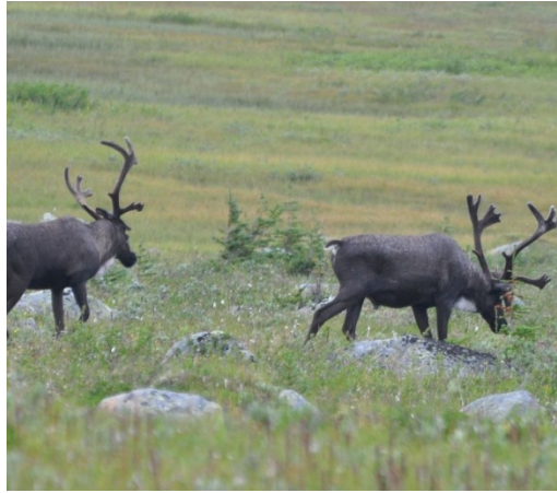
Alberta caribou.

(Ends with several demographic questions)