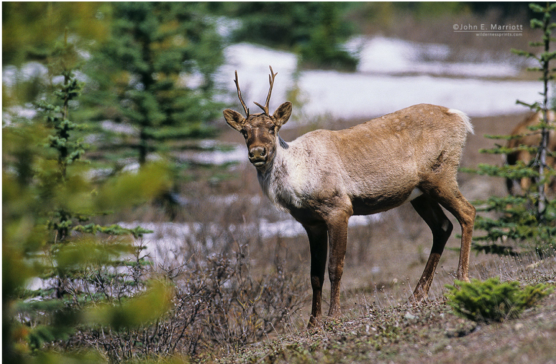
Jasper caribou.

Caribou in Jasper National Park are on the brink of extinction. Backcountry and conservation groups are calling on Parks Canada to reduce human access impacts to the Tonquin caribou, the largest herd left. The Alpine Club of Canada (ACC), Alberta Wilderness Association (AWA), Canadian Parks and Wilderness Society (CPAWS) Northern Alberta Chapter, David Suzuki Foundation and Yellowstone to Yukon Conservation Initiative (Y2Y) are urging Parks Canada to: