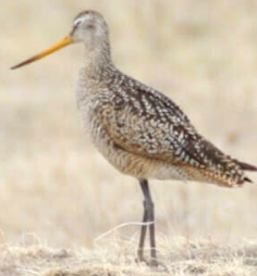
Marbled Godwit observed at Little Fish Lake Provincial Park