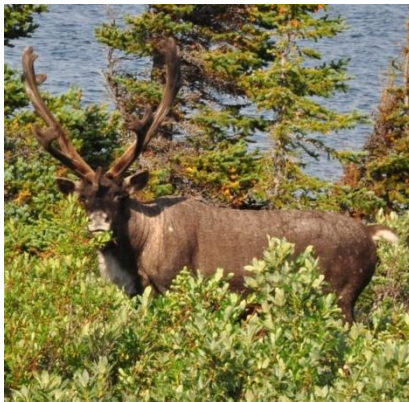
One of Jasper National Park's Tonquin caribou, observed in 2014.