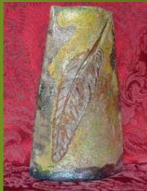
Yellow Feather Vase