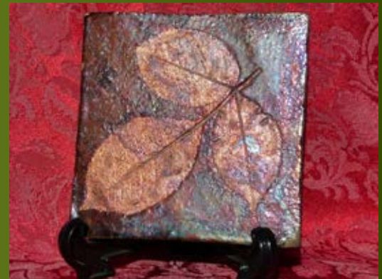
Leaves (a random drop of glaze added a blue beetle)