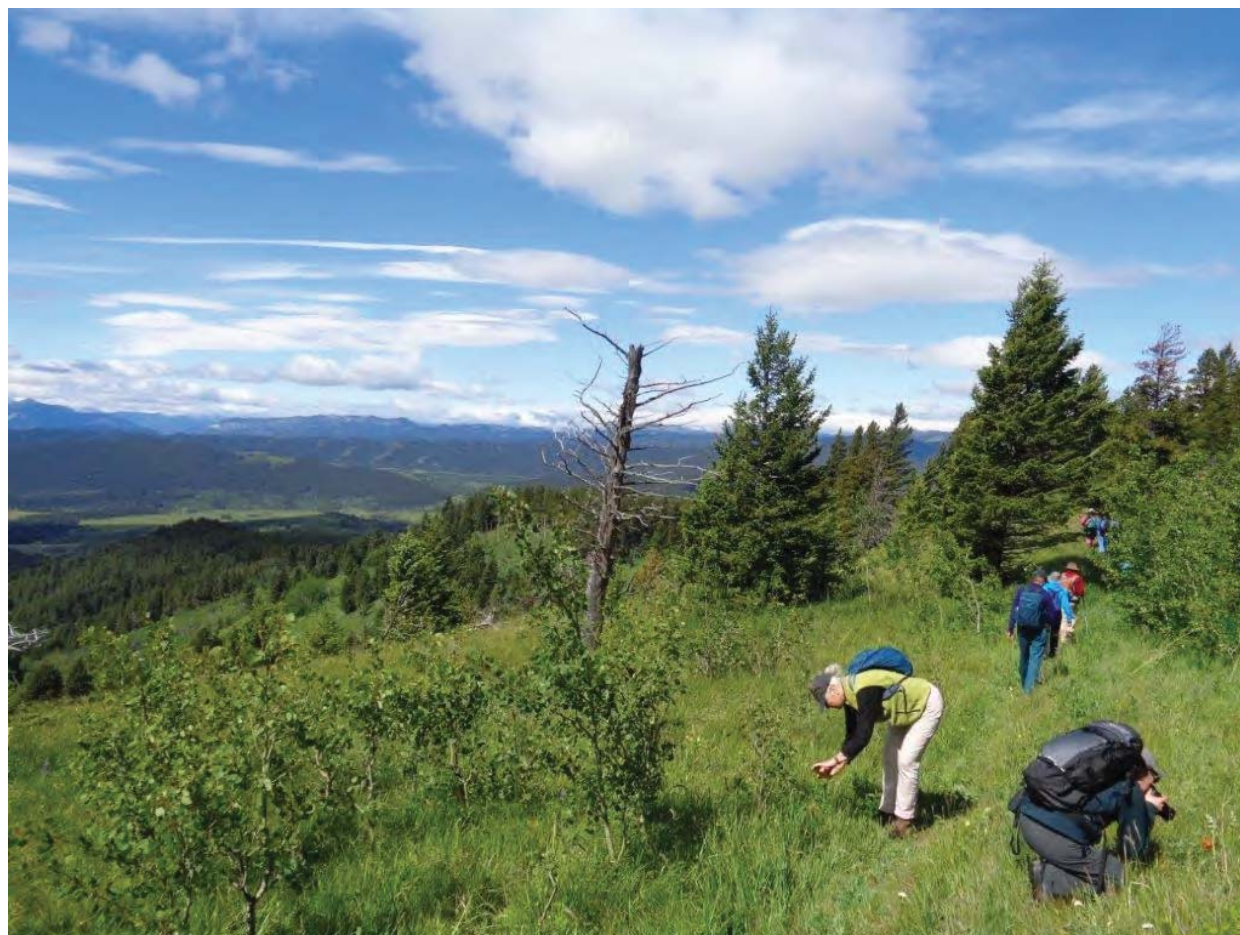
Enjoying the view and wildlife. Whaleback to the left. S. Weber