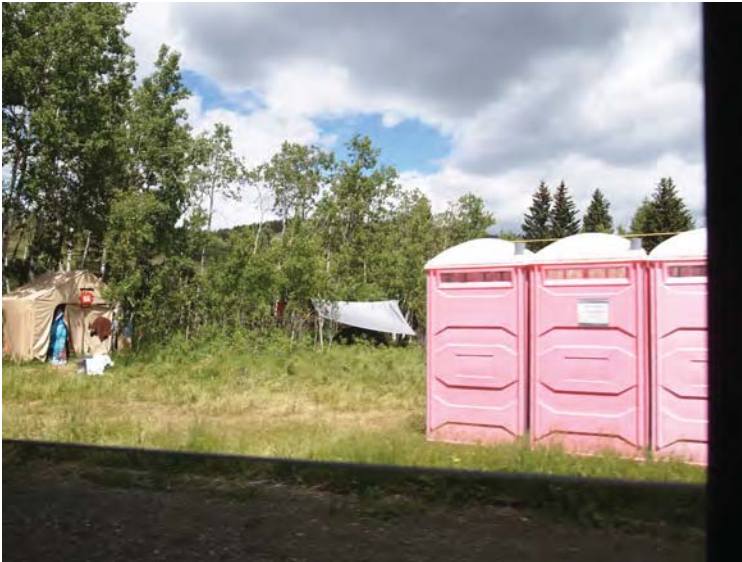
Spray Lakes Sawmill camp A. Johancsik

Photographs: (attach a physical or electronic copy or send to awa@abwild.ca )