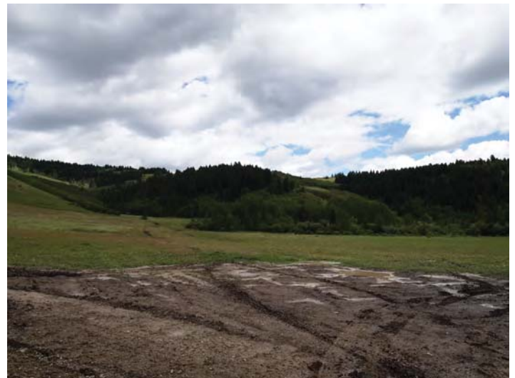
Abandoned well site.