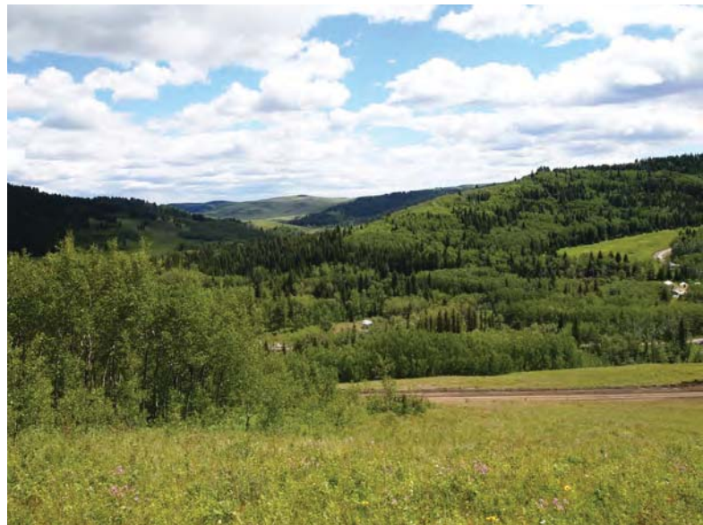
Spray Lakes Sawmill camp in right of photo.