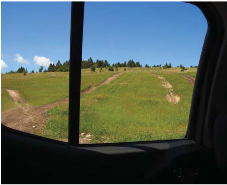
OHV tracks just inside the south boundary of