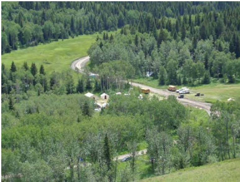
Spray Lakes Sawmill camp.