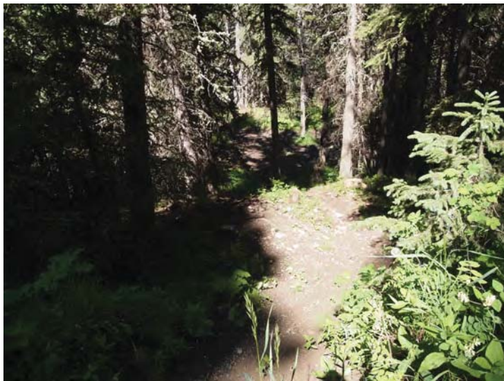
Erosion in creek bed near 'staging area'. A. Johancsik