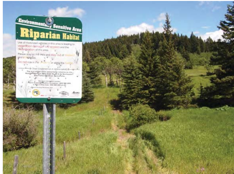
Recent use of an undesignated trail ignoring the bullet-marked stewardship sign A. Johancsik