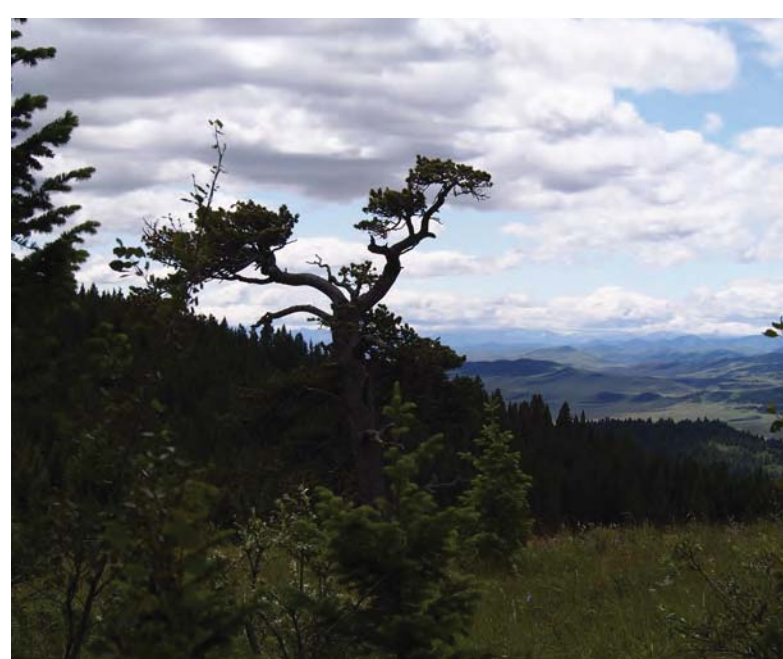
The view.