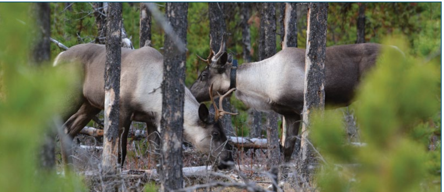
Alberta's woodland caribou are important indicators of the health and intactness of the older forests and peat wetland complexes in which they reside. Their recovery is possible, according to scientists, with habitat-focused range plans.

Is caribou recovery worth the effort? In AWA's opinion, the answer is an unequivocal "yes." Scientists have stated that recovery of woodland caribou is technically and biologically possible. Woodland caribou are marvellously adapted alpine-foothills and boreal mammals. Alberta caribou have a right to recover and thrive in our prosperous province and are important lynchpins for the connectivity of national populations. Our caribou are important indicators of the health and intactness of the older forests and peat wetland complexes in which they reside. If we ensure that caribou have a future in Alberta, many other old growth and wetlands-reliant species will benefit. In west central Alberta, the relatively high, wet foothills forests will provide important 'refuge' areas from climate change impacts. There is no better place to start with strong, habitat-centred caribou range plans. ▲