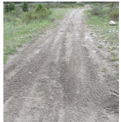
Evidence of OHV use on trails in the Bighorn during annual closure period.

Wider public awareness of harmful impacts, steep penalties for irresponsible OHV, and enforcement are needed to combat the environmental damage OHVs may cause. AWA strongly applauds the government for establishing this project and hopes to see it continued past the end of the summer.