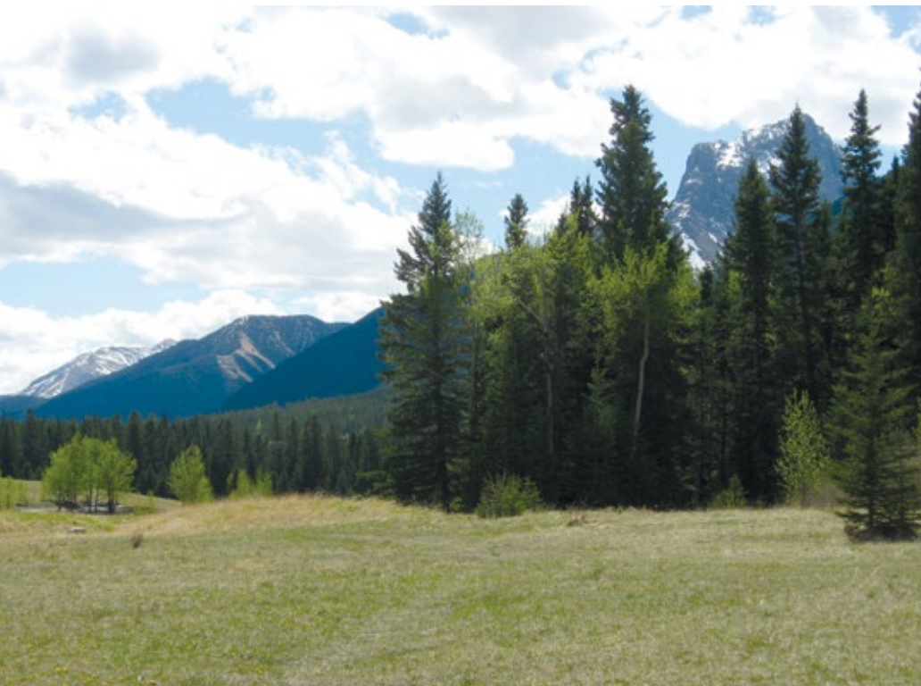
Looking eastward to Stewart Creek and Wind Valley wildlife corridor sections.

Over the years, with increasing pressure for development adjacent to the wildlife corridor, as well as for year-round recreation in the golf course and corridor, it became imperative to provide permanent protection of this primary wildlife corridor. It connects Wind Valley to the Bow and Spray Valleys and Banff National Park so that it remains fully functional for wildlife movement in the late fall, winter, and early spring.