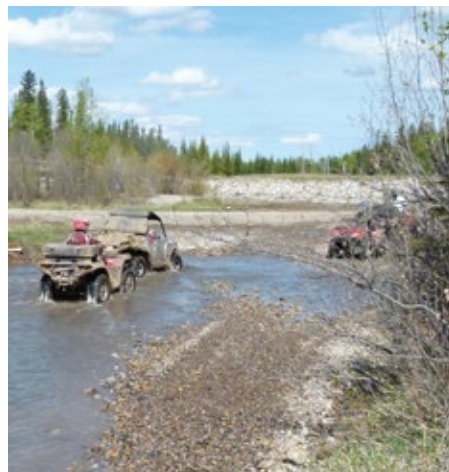
Joyriders in the Clearwater River – later charged

The 23 new positions are being drawn from a combination of conservation officers and seasonal park rangers. Twenty-one of the officers will patrol the Eastern Slopes, operating out of offices in Pincher Creek, the Elbow River, and Rocky Mountain House. The remaining two enforcement officers will operate out of Fort McMurray. All of these new