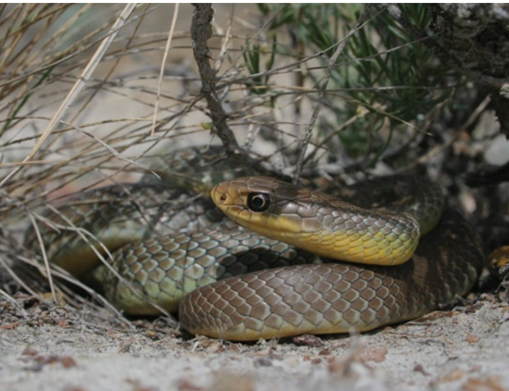
Yellow-bellied Racer.

According to COSEWIC in 2004 (the Committee on the Status of Endangered Wildlife in Canada), eastern yellow-bellied racers are widely, if sparsely, distribut-