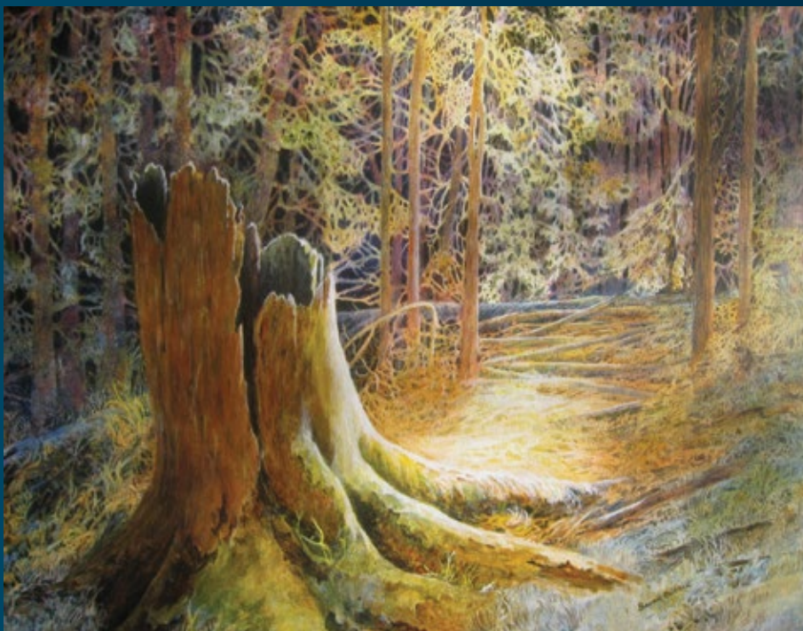
Ancient Guardian of the Forest, acrylic, 16" x 20"