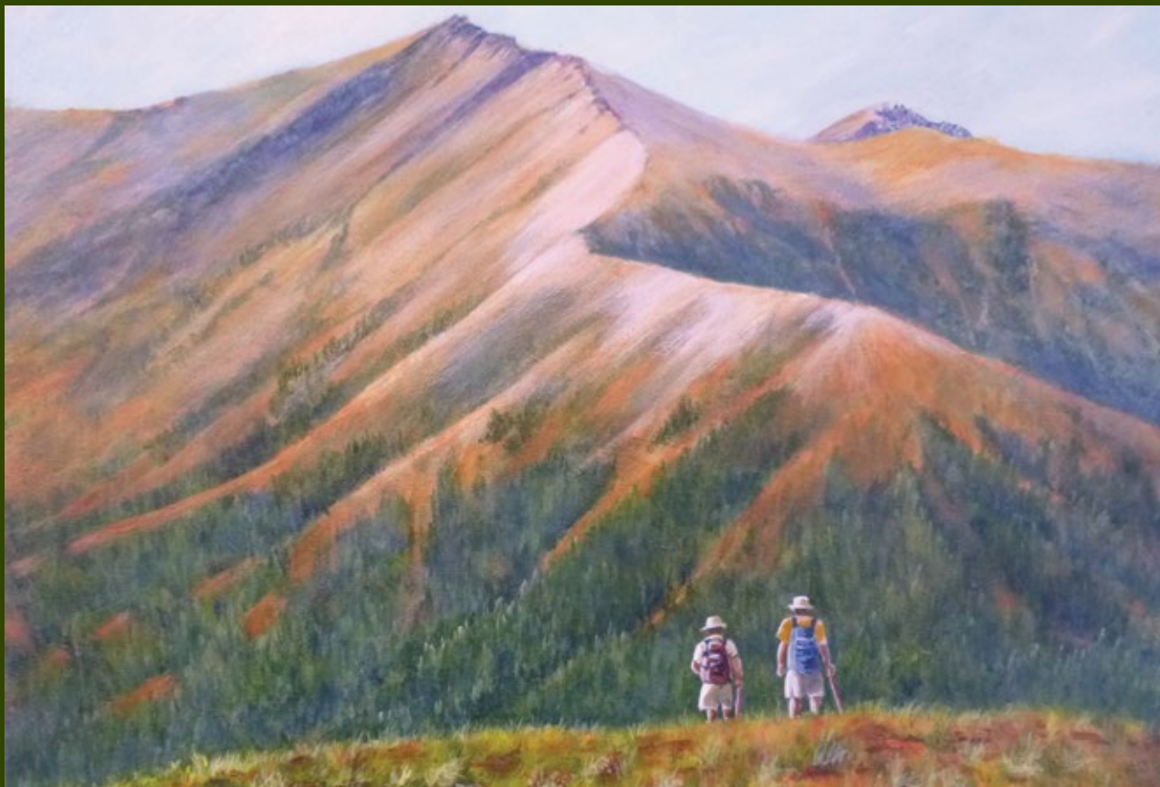
Now On To The Ridge, acrylic, 12" x 16"