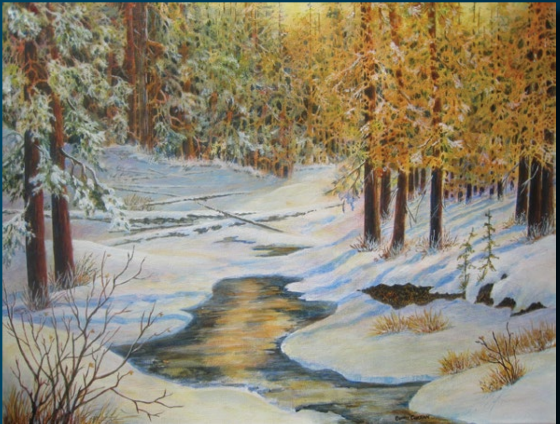
Winter Afternoon, acrylic, 26" x 30"