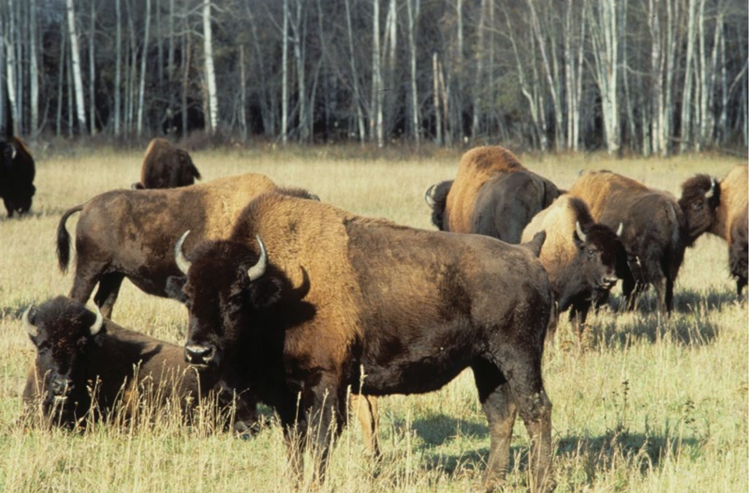
Bison in Wood Buffalo National Park.

will take the form of road constructions (upgrading of existing fire trails in some cases), construction of corrals, holding facilities, and the introduction of potential exotic vegetation (through the introduction of hay to feed captive animals.) Management of reintroduced bison herds also means using helicopters to round up animals and, potentially, to haze bison to keep them in designated areas.