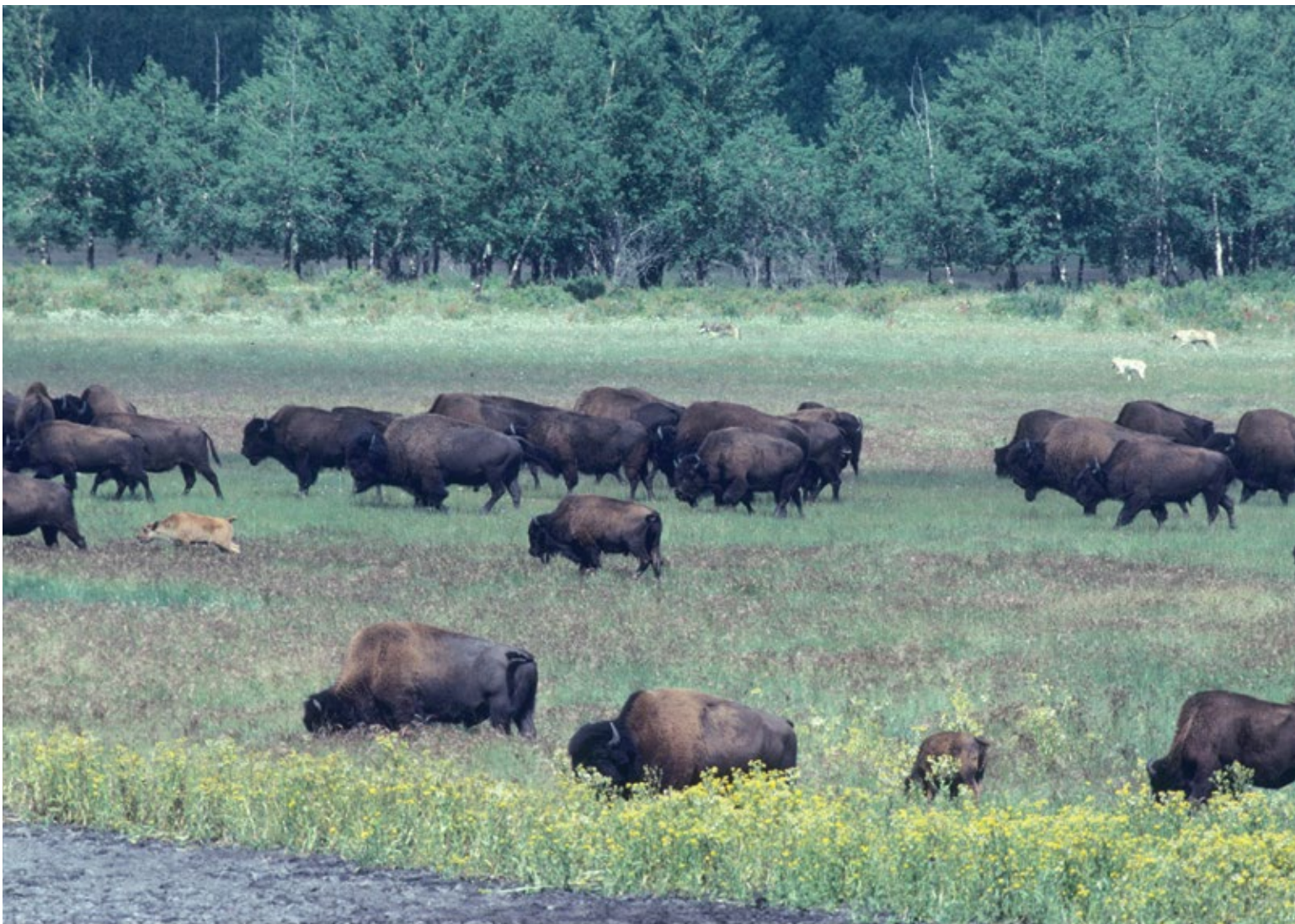
Wolves waiting for an opening, Wood Buffalo National Park.