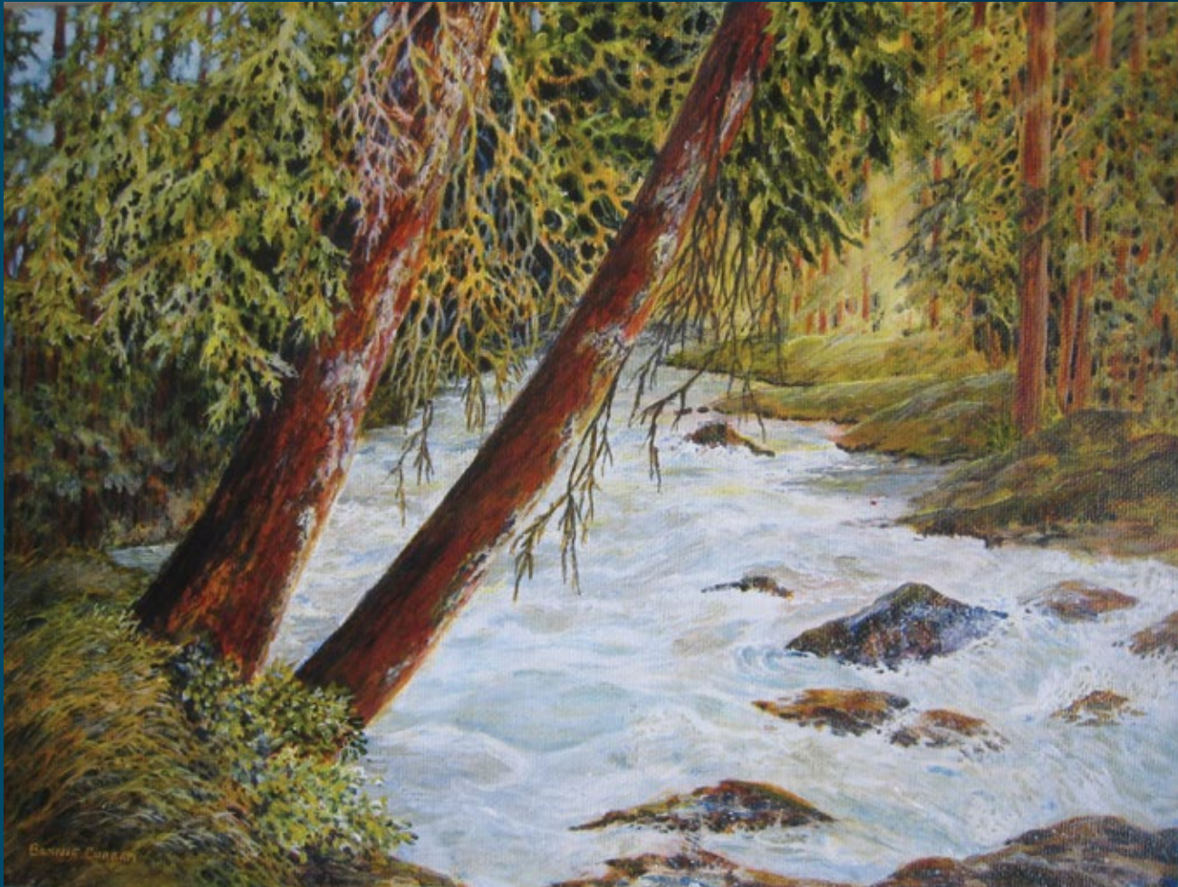
Stepping Stones, acrylic, 12 x 16 inches