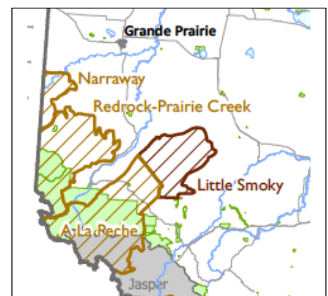
Excerpt of Alberta Woodland Caribou Range map, showing west central range areas with diagonal lines. Protected areas, shown in green and grey, overlap with some caribou range summer habitat but do not include important lower-elevation foothills winter habitat on Alberta public lands.

plan development under the federal caribou recovery strategy. A multi-stakeholder Advisory Group, including AWA and other ENGO delegates, aboriginal groups, industry, and municipalities was launched with great promise in August 2013. The advisory group was co-led by Assistant Deputy Ministers from Alberta's Environment and Sustainable Resource Development (ESRD) and Energy departments and set early 2014 as the target date for submitting completed range plans. We all know what year it is now. AWA saw great collaborative potential in the multi-stakeholder group. This opportunity to transparently model scenarios to optimize habitat-focused range management was squandered. Its last meeting was December 2014 and there are no meetings on the horizon. While the Alberta government continues to develop these range plans it does so without including environmental groups. We hope Ministers Phillips