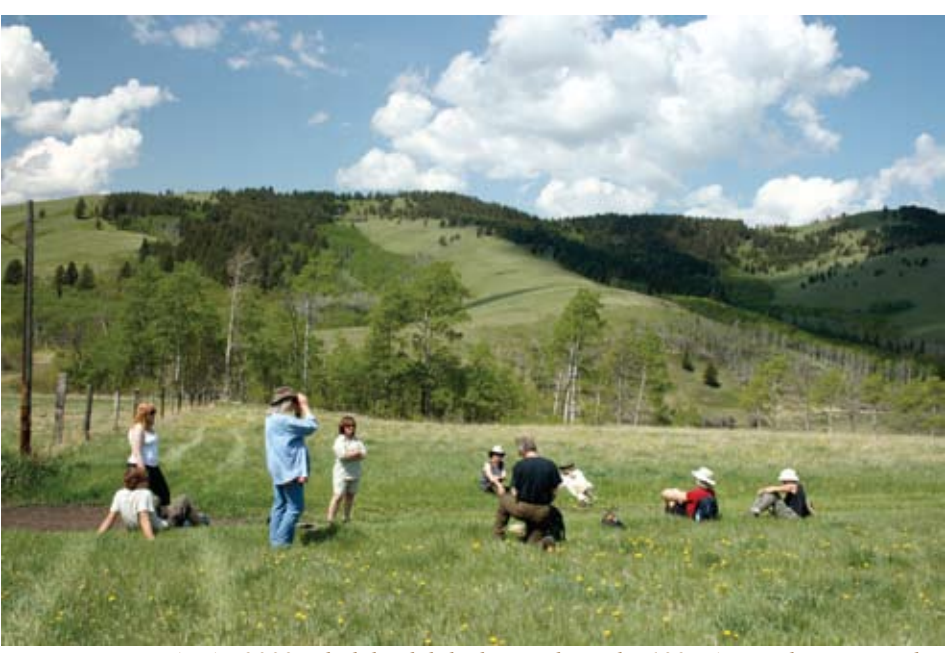
Participants in AWA's 2009 Whaleback hike learn about the 1994 Amoco hearing at the site where the company proposed to drill for natural gas.

For these two there is no question or doubt about why they do what they do; it is clear to them. "I am here to try and protect some things that don't have a voice," says James. "Wilderness protection is about giving a voice to those who can't speak. We work on these things here, with the resources we have, just as other AWA people apply their skills to