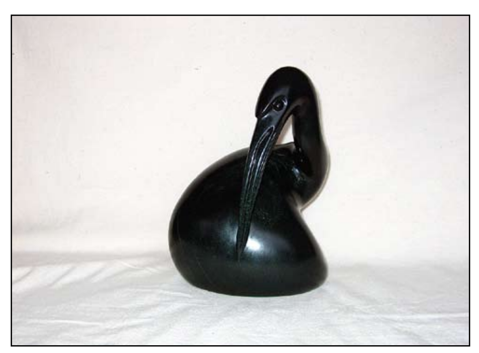
Turn Away. 8"H x 7"W x 12.5"L Serpentine.