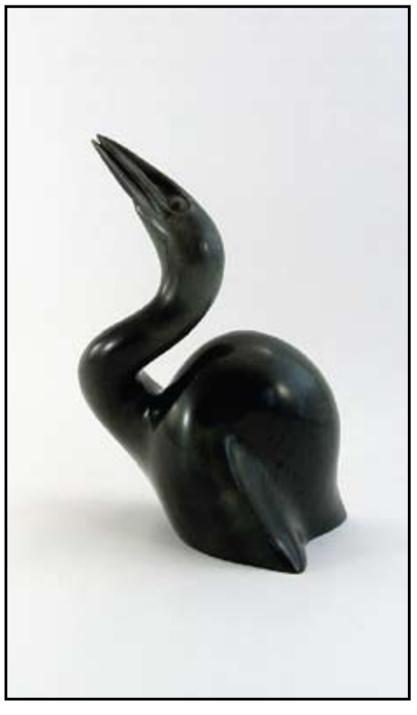
Mating Dance. 23cmH x 17L x 12W Serpentine.

Seeing the need for a local group to address public land issues in the South Castle headwaters and to work directly for its protection, James and Judy have worked towards its goals for several decades. The Crown in the organization's name represents "Crown of the Continent" – an initiative to see