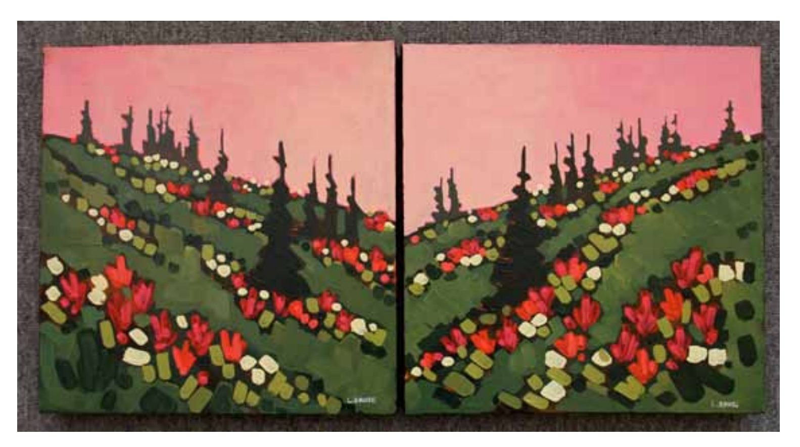
Summer Meadows 16" x 32" acrylic on canvas © LUCIE BAUSE

Canada fishing permit it is open season from May 18 to September 2 subject to prescribed limits and prohibitions on catching protected species such as Alberta's provincial fish, the bull trout. There is no magic in predicting when Crandell Lake will actually thaw, but all bets are off until at least June. Any amateur fisherman or fisherwoman can catch a trout there, particularly if you try late in the evening around dusk. Although barbless hooks are not mandatory I use them to enable me to release fish more quickly and, hopefully, more humanely. I also find that synthetic nuggets are more effective than worms and artificial flies, especially the yellow ones which appear and feel like small marshmallows.