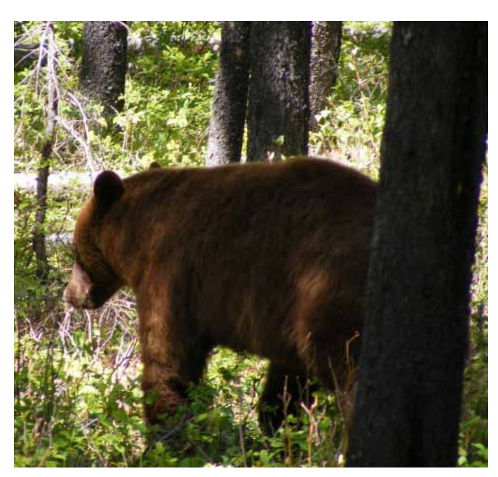
Few may realize that what people do in Waterton has pushed grizzlies and black bears out of the park onto private lands.

Waterton is a land that once belonged to the Blackfoot people and now to all Canadians. The important value that defines a national park is that it belongs to everyone; not just the Crown, the