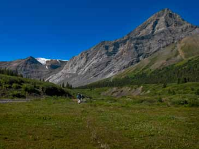
Persimmon basin, Willmore Wilderness Park.