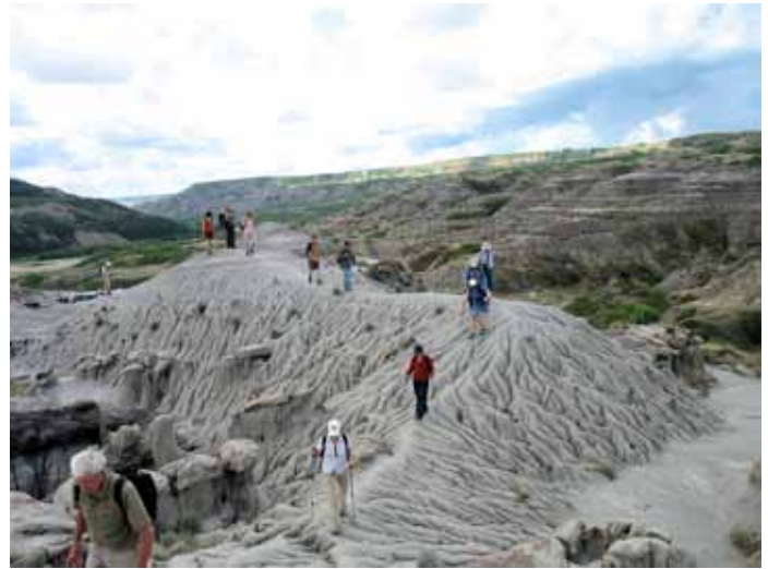
Participants in AWA's "Newcomers to Wild Spaces" program were able to explore the dramatic landscapes of the Dry Island Buffalo Jump.

As we approached the Park, there was a strong chorus of "oohs and ahs" as the ground gave way and the Red Deer River Valley appeared before us. The students were captivated instantly by the views from the lookout, scanning along the buffalo jump and across to the mesa. We were fortunate to have local residents and AWA members, Rob and Tjarda Barratt, as tour guides for the day. Their love and knowledge of the area and its history were evident immediately. As they shared details on how the area was formed and how it has been used over the centuries the interest in the day's hike grew. The highlights for many included hearing about near-by fossil discoveries that created the hope they might stumble across a dinosaur bone. Such hopes depend on insuring that that precious landscape remains intact.