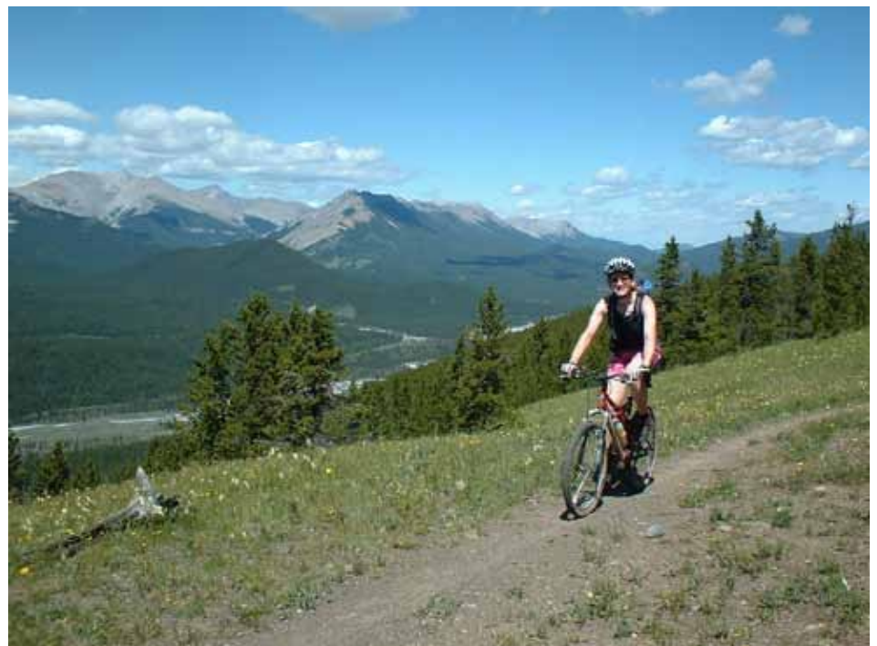
Mountain bikers on the Moraine Lake Trail, one of the few trails in Banff National Park that allows mountain bikers.

Certain trails lend themselves perfectly to mountain biking. Elbow Loop in K-Country west of Bragg Creek is one example. The entire 46-kilometre distance is on old four-wheel drive roads that are