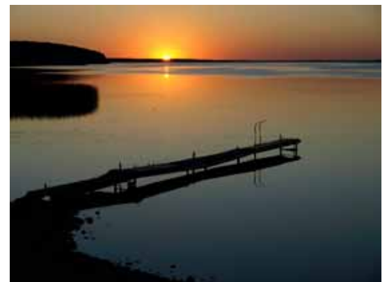
A summer evening on Lac La Biche. A pro-active approach to plan intensive recreation areas away from the most ecologically sensitive parts of Lakeland Country could be of positive environmental and economic value for the southern Lower Athabasca region.

Another key weakness of the Vision document is this very weak guidance on a wetlands policy: "implement Alberta's new wetland policy once it is developed." Alberta's commitment to extend a wetland policy to the northern boreal forest is years overdue, and the policy should be the widely-supported compromise policy negotiated at the Alberta Water Council to maintain wetland areas and functions at a provincial level. We need to protect the exceptional McClelland wetland complex, Peace Athabasca Delta and other highly ecologically-valuable wetlands from industrial development. For other wetlands, in line with the "polluter pay" principle, industrial development proponents should have strong incentives to avoid wetland loss in their project design and compensate for boreal wetlands degraded or destroyed. Another huge concern is the proposal to allow significantly more destructive forms of forestry on public and private lands. AWA strongly rejects the recommendations that would allow forestry practices such as plantations, genetically modified species, thinning, and fertilization on public lands outside Conservation Areas. These