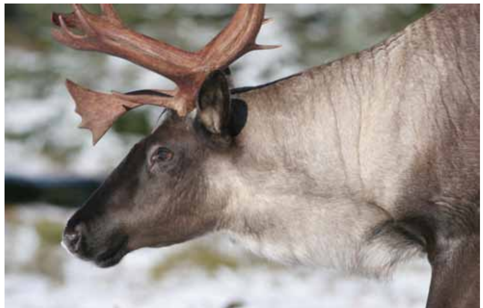
Alberta's assault on caribou habitat continues.

In July 2009, a federal court judge in Vancouver ruled that Environment Canada broke the law by refusing to identify critical habitat in a recovery plan for the endangered greater sage-grouse