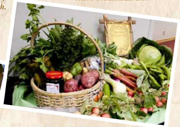
The Red and White Club was turned briefly into a farmers' market as the tables overflowed with a wealth of freshly-baked goods and produce for sale at the auction.