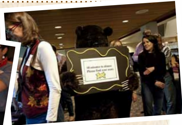
One way to get Albertans to pay attention to grizzly bears may be to ask the bears to hand out the grub!