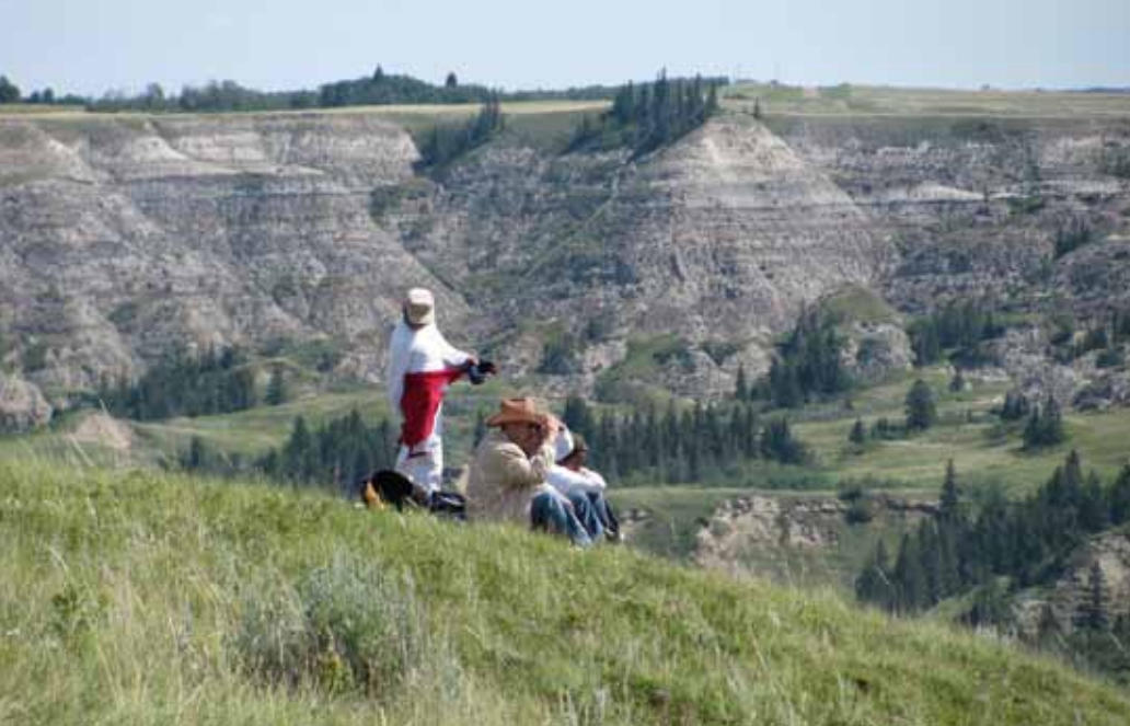
Dry Island Buffalo Jump Provincial Park.