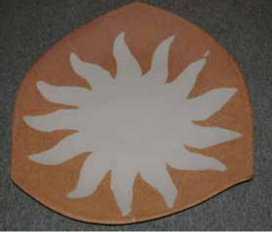
"The Sun" was created with red clay from Medicine Hat. The clay's textures add dimension to this large piece.