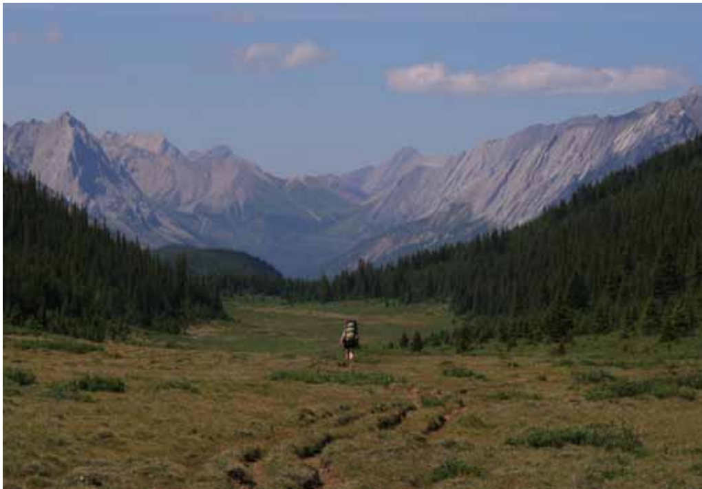
Backcountry experiences, far from the madding crowds and luxury shops found in any airport, help visitors better understand what makes Banff such a special place.