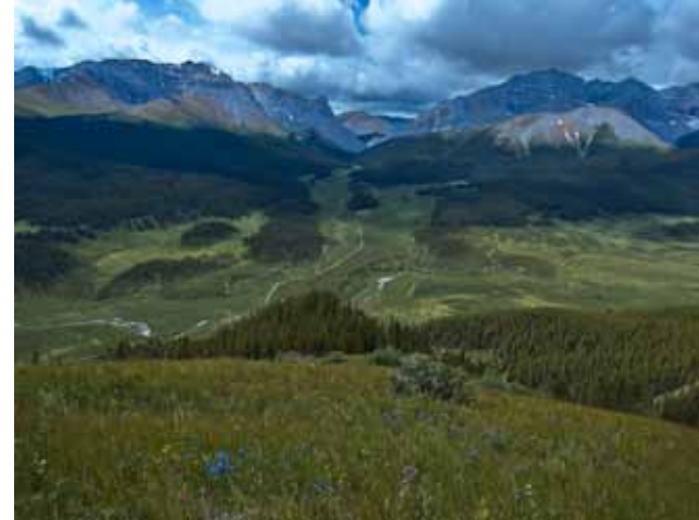
Ridgetop view of Eagle's Nest Pass, Willmore Wilderness Park.

Although AWA supports many of the activities and statements of the Willmore Wilderness Foundation (WWFdn) we part company when it comes to one important possibility for the future of the Willmore: UNESCO World Heritage Site status. In 2006 the United Nations Educational, Scientific, and Cultural Organization