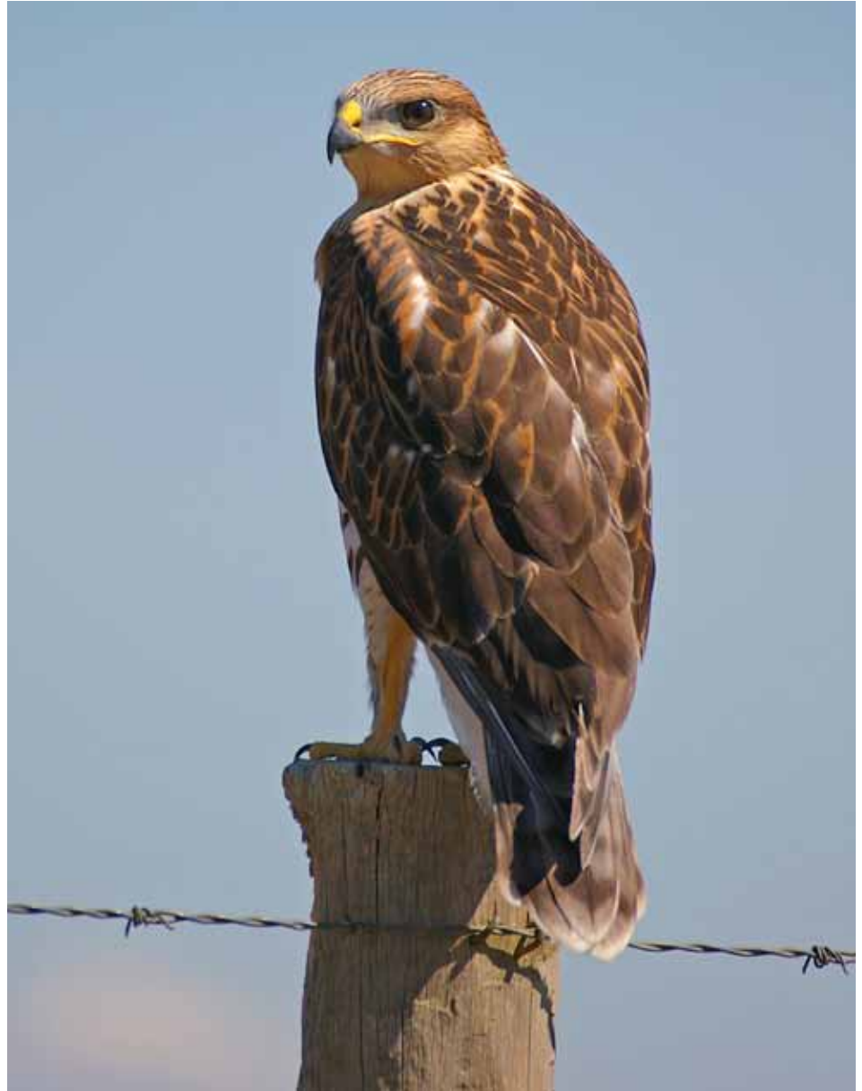
Habitat for numerous species at risk – such as this ferruginous hawk – stands to be destroyed if the proposed Bow Island land sale goes ahead.

According to Minister of Sustainable Resource Development Mel Knight, speaking in a radio interview on Let’s Go Outdoors radio, broadcast on September 19, this counts as doing business “in an open and transparent manner.” In that interview, Minister Knight commented: “There never is a requirement for public consultation with respect to the sale of public land for agricultural use. This has