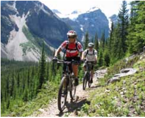
Mountain bikes are an increasingly popular means to travel in Alberta's backcountry.