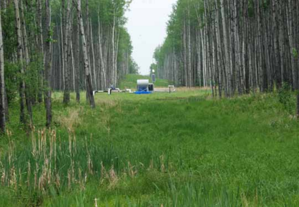
This conventional oil and gas installation on the approach to Lakeland Provincial Park is but a small example of growing linear disturbance fragmenting Alberta's boreal landscape. Conservation Areas with active forestry and tar sands leases, as proposed in the Lower Athabasca Vision document, would be practically meaningless for protecting ecological integrity.