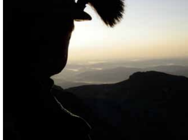
Dawn from the summit.

Once we reach the valley bottom, I can tell from the faces of my companions that this was more than just a good workout for the new mountaineers – it was also a profound nature experience, maybe even something spiritual. It begins in the silence and dark, and proceeds to beauty and light where we admire the splendour of life on the mountain. It happens to me every time I hike Black Rock Mountain. 🌄