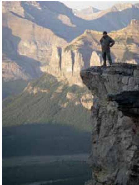
On top of the world.