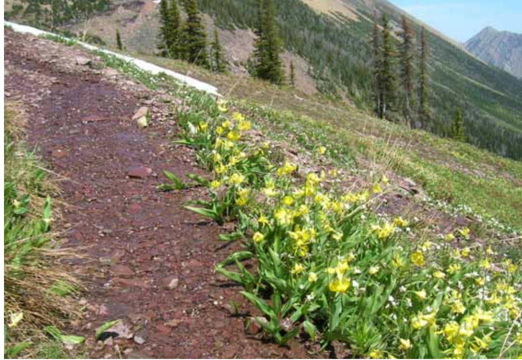
Lilies on the trail in Waterton National Park.

While this arguably betrays the democratic process, what is equally as disappointing is the eagerness with which certain individuals and environmental groups embrace and defend their now