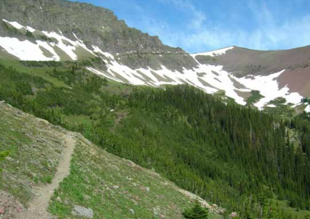
In the backcountry of Waterton National Park.