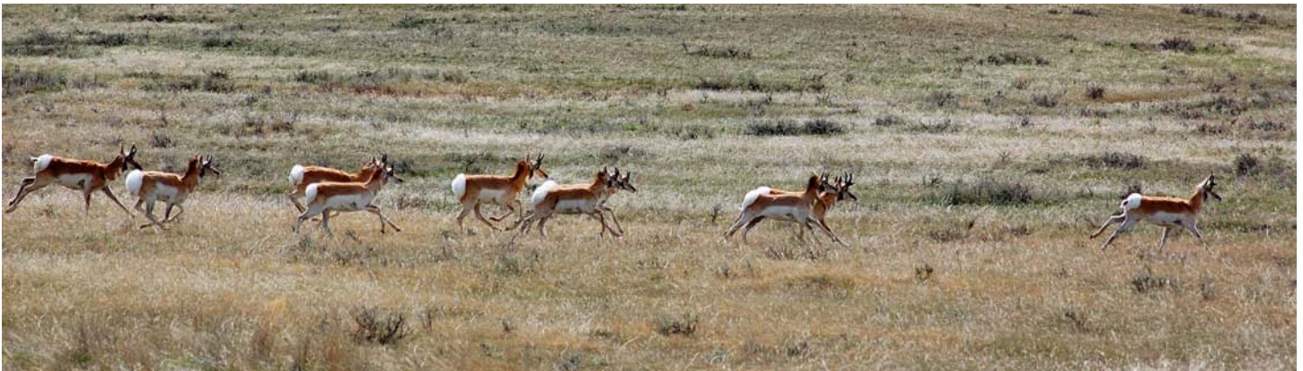
Antelope south of the Cypress Hills

B orn in Southern Alberta, I never much cared for the term bald prairie. Short grass prairie was my playground. I shared it with ants, cactus, rattlesnakes and some of the most remarkable biology in the world. Some may find this remarkable considering the climate has some similarities to Siberia. If you ever wonder how to respond to the opinion that any part of Alberta is just an empty expanse, here is an idea, by way of an anecdote, how you might