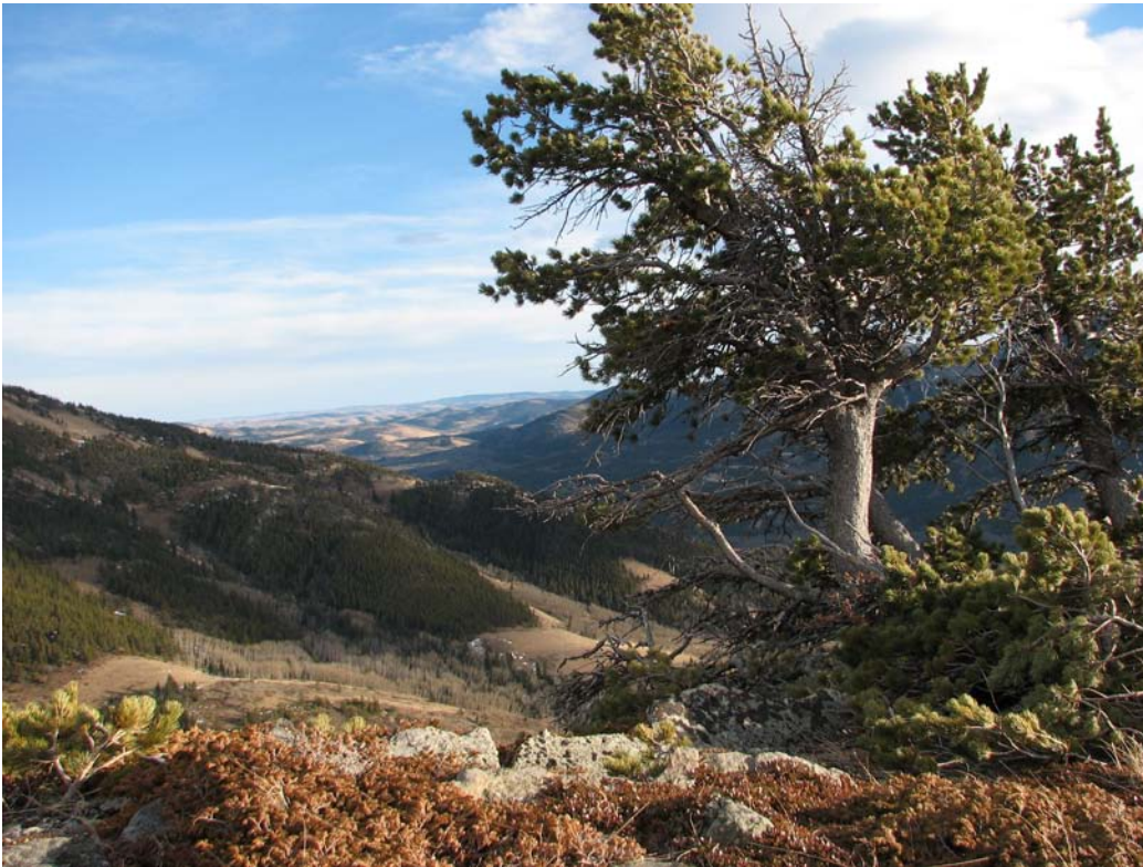
Looking across from the Bull Creek Hills towards the location of the 11 proposed sour gas wells.

Some unspoiled areas like this part of Kananaskis Country are too important, and the damage inflicted by development too severe, to allow such a major development to take place. It is unlikely that any shovels will hit the ground before 2011: in the meantime AWA will continue to work with other opponents of the project to explore whatever avenues exist to halt this project before it is too late. 🍷