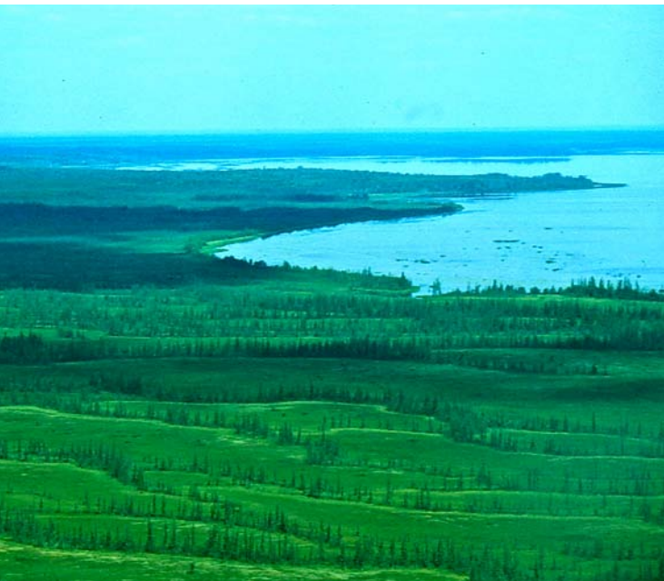
McClelland Lake Fen

a similar riparian area located elsewhere (e.g. by the oil sands mine). To ensure that a cumulative benefit to ecological integrity occurs, the damage to ecosystem services being offset should be less (sometimes by an order of magnitude) than the current and future flow of