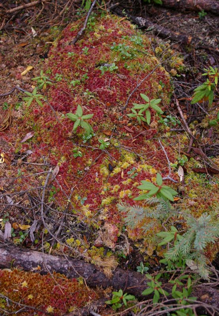
Autumn-coloured mosses in a sensitive peatland area south of Touchwood Lake in Lakeland Provincial Recreation Area. There is no method of replicating the deep peat layers of virtually all northern wetlands once they are destroyed. That is why it is so vital that northern wetlands are respected and protected finally in a provincial wetland policy.

industrial development, there are no proven techniques for recreating them. In the Athabasca oilsands region, wetlands cover around 50 percent of the natural region, and 90 percent of these wetlands are peat forming.