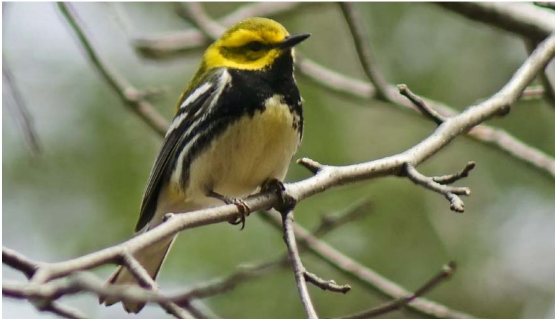
Black-throated green warbler. This warbler is one of approximately two-dozen wood warblers that breed primarily in Alberta's boreal forest.

would otherwise go unnoticed. For these and other reasons, it may not be surprising to learn in the U.S., 22 percent of the adult population lists birding as one of their activities. In 2001, the U.S. Fish and Wildlife Service reported that this interest generated (along with other wildlife watching), an economic impact estimated at $32 billion! Not only is birding fun, it's big money!