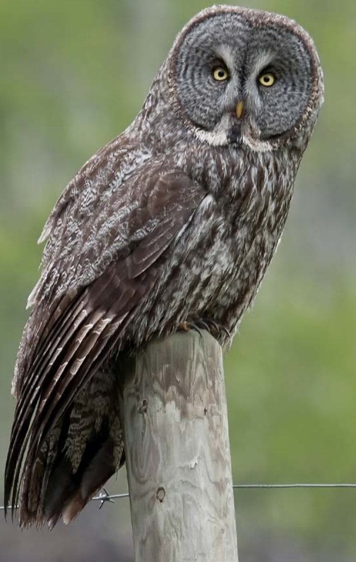
Great gray owl. This handsome denizen of Canada's boreal forest, unlike many owls, may be seen hunting in the daytime.