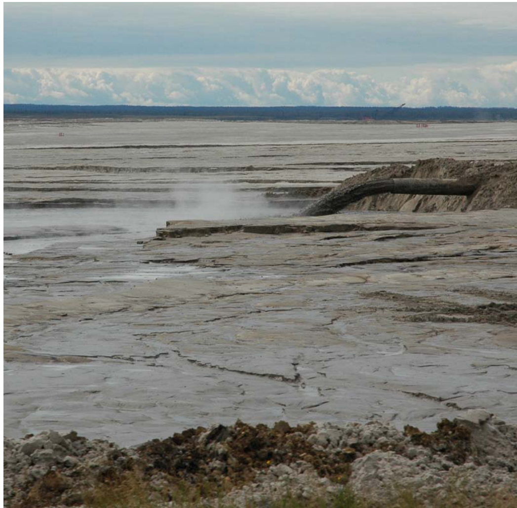
Syncrude’s more accessible Mildred Lake Tailings Pond. Tailings ponds attract migrating birds to their toxic open water, particularly if other water bodies are still frozen, as was the case in April 2008 for the 1,600 ducks that mistook the Aurora Mine tailings pond for safe haven.

In April 2008, with adjacent non-toxic water bodies still frozen over, a heavy snowstorm prompted over one thousand migrating waterfowl to seek rest in the open water of Syncrude’s Aurora tailings pond. On April 28th, a senior wildlife biologist at Alberta Sustainable Resource