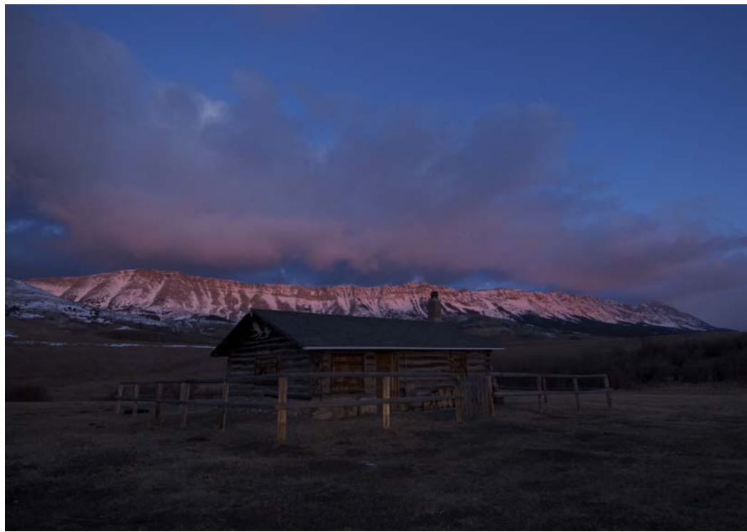
The historic DU Ranch, just off the North Burmis Road, looks out over the Livingstone Range. The proposed magnetite mine would be directly within the viewscape of the ranch.

Though many species require large areas of suitable habitat in order to survive in the long-term, it is also crucial to bear in mind the fine-scale habitat requirements that some species need within those broader areas. This is shown very clearly in a recent study of bull trout in the