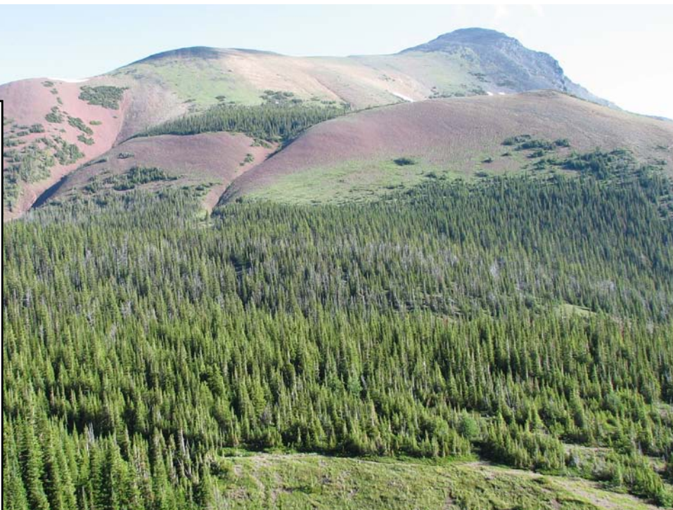
The ecosystem services – such as production of clean water – provided by headwaters forests such as these in the Castle seriously challenge the dollar value of “vertical timber.”