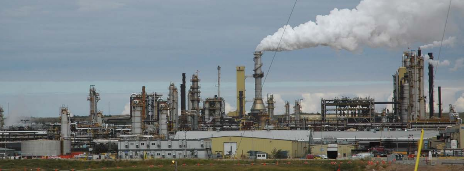
The Syncrude case testifies to the unreliability of information collected by tar sands operators about the wildlife mortality caused by their mining operations. Hopefully, the Syncrude verdict will improve dramatically the lax approach to wildlife deterrent systems applied to tailings ponds.

correct lax environmental attitudes and procedures prevalent in a long-time oil sands mining operator. Syncrude, and by extension its Imperial, Exxon-Mobil and other partners, did not live up to their rhetoric about providing global best practices on environmental issues. As such, this case reveals the critical importance of strong environmental laws and the political will to enforce them. 🐾