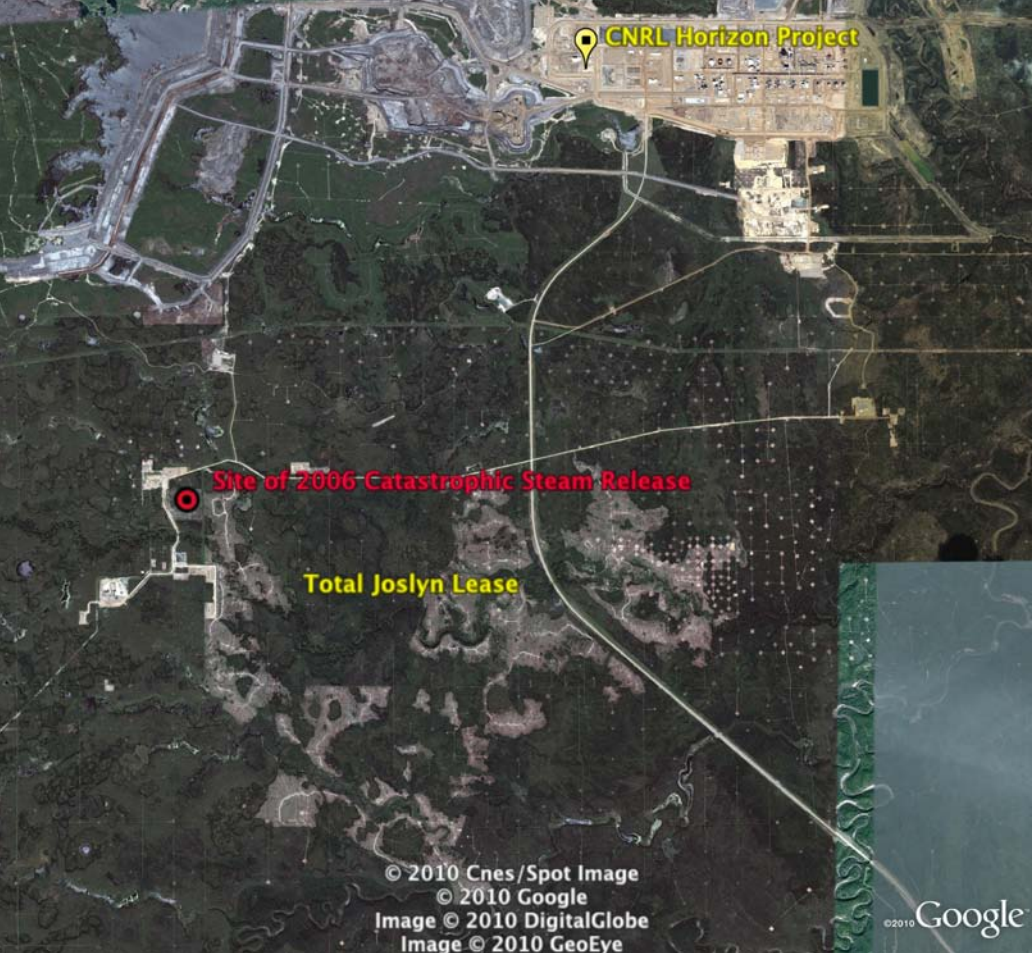
Google Earth image of Total's Joslyn Creek operations from an altitude of approximately 12 kilometres. The blast affected area - what the ERCB calls "a surface disturbance" - covered an area of about 125 metres by 75 metres (larger than a Canadian Football League field). A very disturbing aspect of the ERCB's analysis and review of this blast is that an abandoned evaluation well that was not cased and could not be detected from the surface may have provided a pathway for steam and hot water to travel and pool before exploding through the surface.

will be monitored and alarmed, and "automated steam shutdown controls will intervene if the operators do not reduce the bottomhole steam injection pressure." Automated shutdown clearly did not happen. ERCB staff concluded that Total "was in noncompliance with the approved operating strategy for ensuring that steam injection could not accidentally exceed fracture pressure." This analysis suggests there must be better clarity on the maximum allowable pressures in SAGD project approvals, and better auditing of SAGD project operators' monitoring and shutdown procedures.