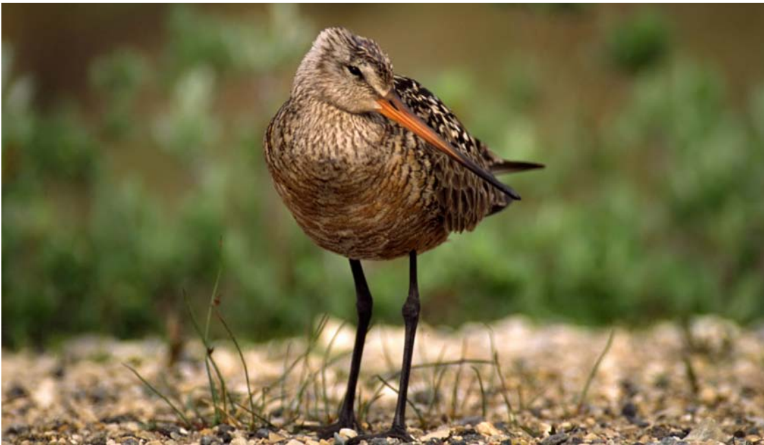
Hudsonian godwit. This shorebird, which migrates through the northeastern tip of Alberta, breeds in only a few places in the boreal forest. It may arguably be considered a vulnerable species.

because breeding success is critical to long-term population stability, it is clear that protection of Canada's boreal forest must take a high priority. By acting now, we may be able to prevent the "Silent Spring" Rachel Carson warned us about more than 50 years ago.