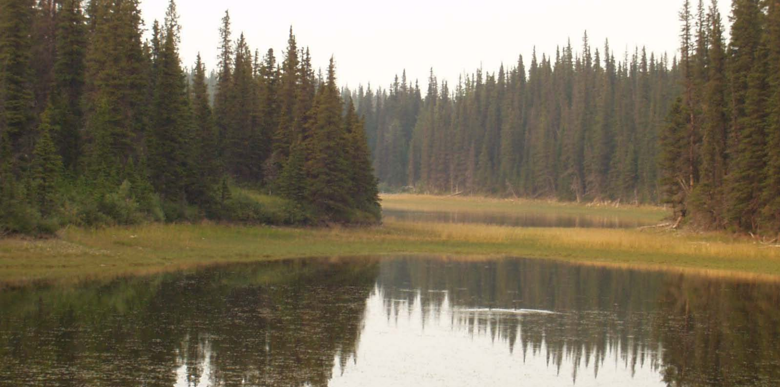
Healthy headwaters forests play a critical role in production of clean water. Waters from the Ghost watershed feed into the Bow River and so the only Calgaryans who are not impacted by forest management in the Ghost are those who do not drink water or use it in any other way!

activities described...result in cumulative impacts to the ecological composition, structure, and function – the ecological integrity – of the Ghost River watershed.”