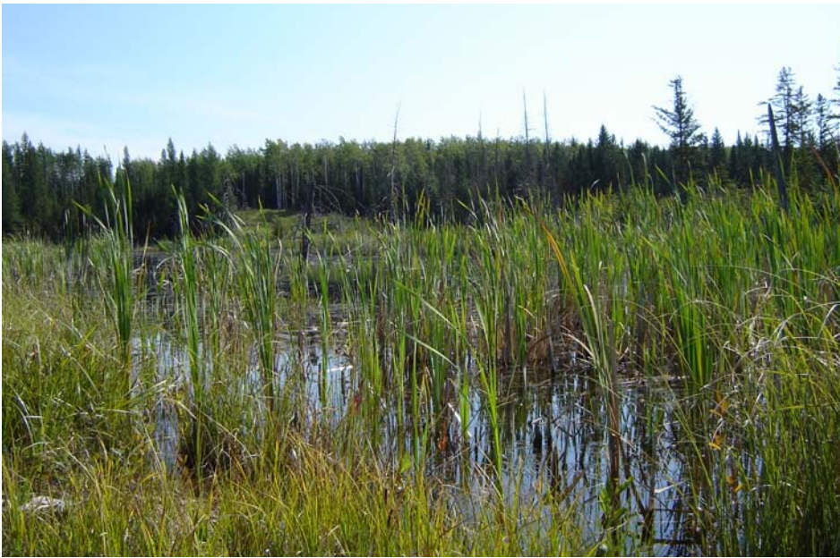
Several major North American migratory bird routes cross the Athabasca oil sands region and wetlands such as these provide vital resting and breeding habitat for migrants. The provincial government appears set to assign low value to boreal wetlands because they are abundant on the landscape.

in March 2010 the documents were pulled from the Chamber’s website. One document stated: “on January 30, 2009, Alberta Environment said that changes were being made to the Wetland Policy and Implementation Plan that would reflect the compensation flexibility, and integration into the Land Use Framework using a sustainable development approach that were requested by ACR and CAPP [Canadian Association of Petroleum Producers].” Furthermore, remarks by ACR’s Executive Director claimed: “The Province has agreed to three of the four changes to the proposed Wetlands Policy that ACR suggested in a letter of non-consensus we delivered to the Ministry of Environment in July and while the Wetlands Policy has not yet been implemented, these changes may save literally billions of dollars for our members in the future.”