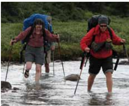
Trekking poles make river crossings safer, particularly when you are weighed down with a heavy pack. Hikers on AWA's 2009 White Goat backpack trip make their way across the Brazeau River.