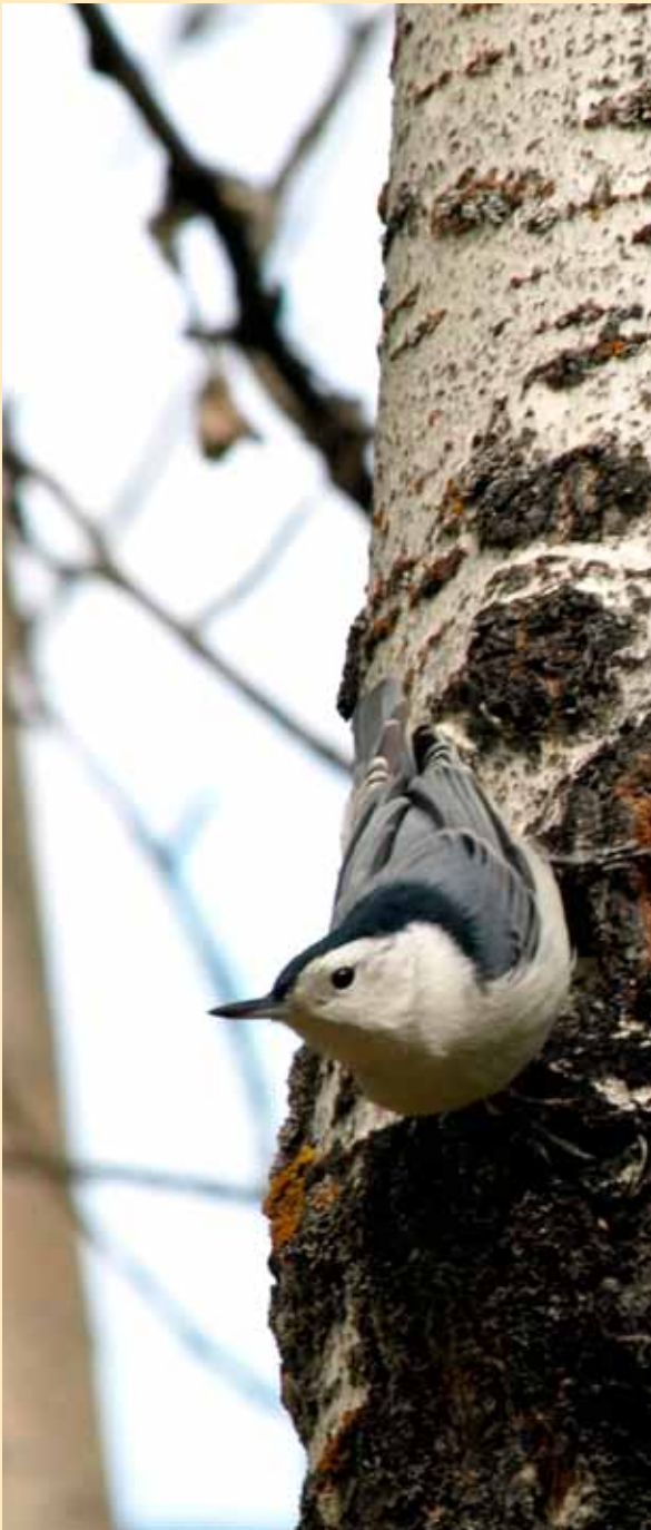
White-breasted nuthatch