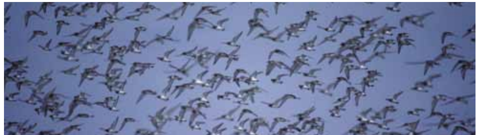
A “grain” of sanderlings. The sanderling is a complete migrant that breeds in the High Arctic. It travels between 3,000 and 10,000 kilometres from those breeding grounds to its wintering grounds.

Migration is related primarily to the scarcity and abundance of food and is typically triggered by day length and weather. A classic example of this is the extreme fluctuation in food associated with seasonal productivity in the northern part of our continent – most bird species flee this region when food is scarce in winter, only to return to feast during the extraordinary peak in insect life in summer. The numerous species that make