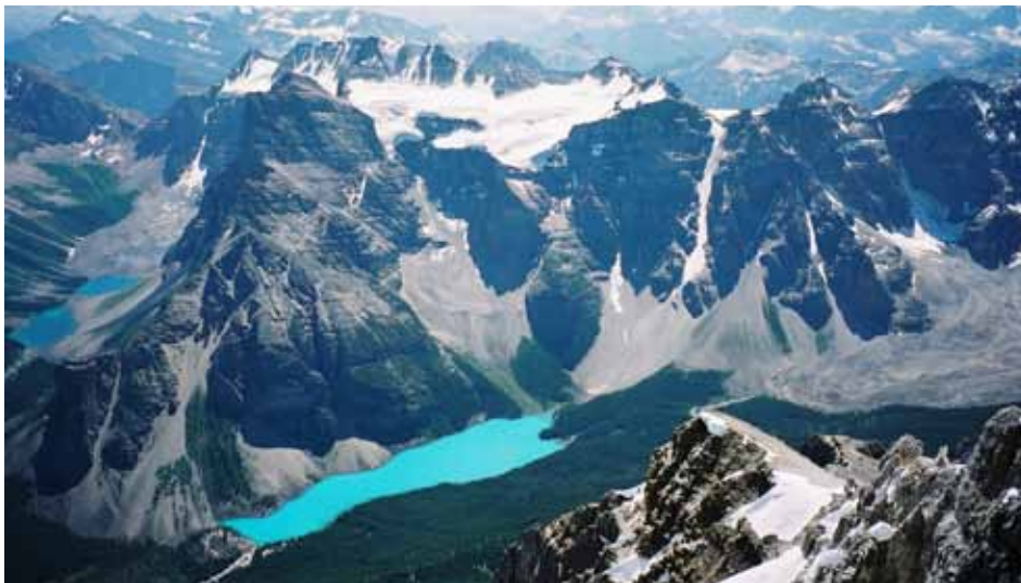
Moraine Lake and the Valley of the Ten Peaks from Mount Temple