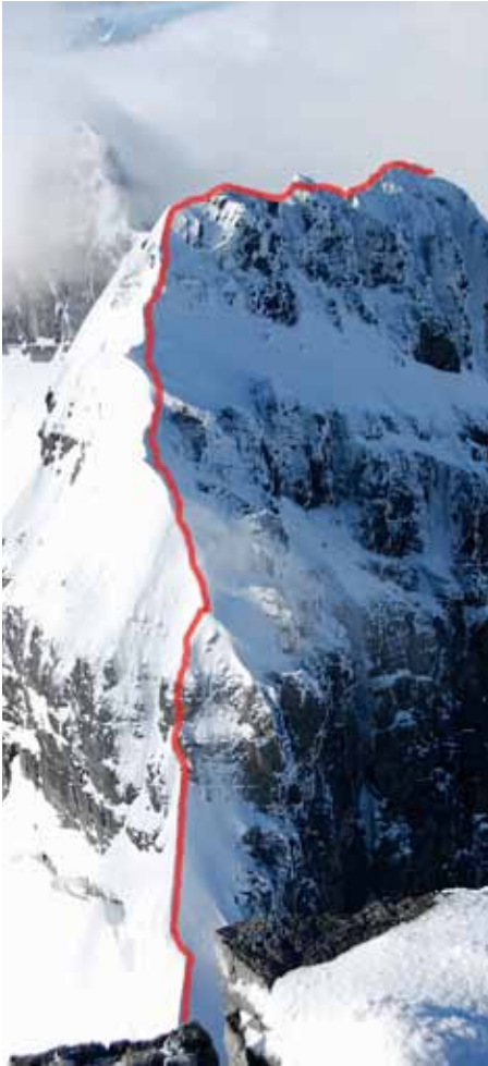
Lyell 4's North Ridge Route (as seen from Lyell 3)

All of us, regardless of where we live, can value wilderness protection as a means of ensuring biodiversity, creating spaces for threatened species to thrive, and protecting the health of watersheds that are essential to life in distant towns and cities. But wild places also allow for a range of low impact recreational pursuits that do a lot to restore our individual bodies and souls to good health. The combination of physicality and connection to our natural world that is experienced while paddling, hiking and mountaineering is something I value more than the material benefits