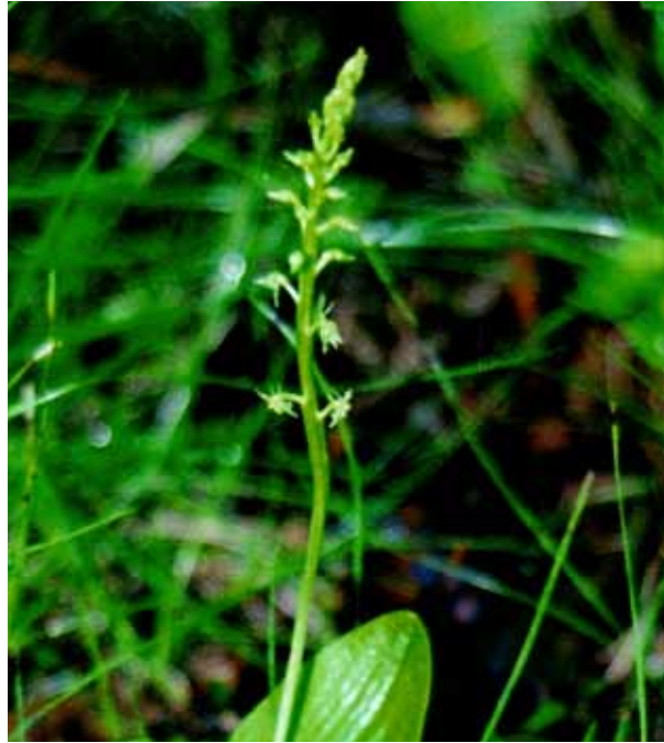
The rare white adder's mouth orchid

- Tom Maccagno (Tom's poem first appeared in the June 2002 edition of Wild Lands Advocate .)