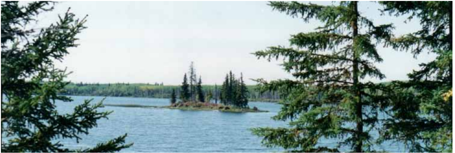
For many Jackson Lake is synonymous with the canoe circuit in Lakeland Provincial Park.

elephant head flower (when I first saw it, I recall saying to myself, “what a delightful flower, it looks just like an elephant’s head!”), small mouth columbine, spotted touch-me-not, and others. I also have had encounters with mushrooms and fungi with weird names (e.g. witch’s butter, shaggy mane, fairy puke, and dead man’s fingers to name a few). Observing a number of the colourful bird species in Lakeland was, and remains, always exciting (e.g. western tanagers, Baltimore orioles, red breasted grosbeaks, and various warbler species).