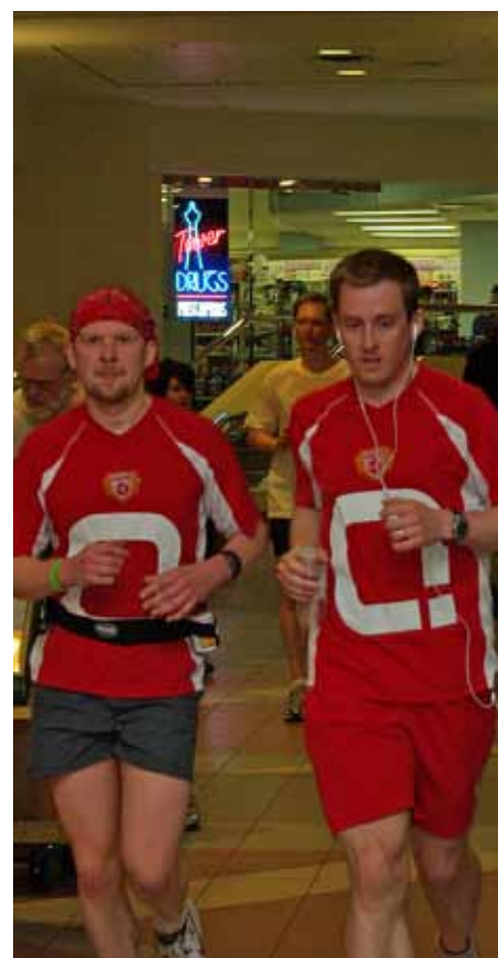
QuIC on the run

of excellence as they ran the stairs, mingled in the crowds and joined in the awards ceremonies. Shell Canada's five corporate teams provided QuIC with some healthy competition. Shell Canada is the Climb and Run for Wilderness's Platinum Sponsor, bringing to this event recognition of the work we do together to ensure the highest possible standards are met when operating in our wild spaces. Suncor Energy was a new corporate sponsor this year and continued the support we have received in the past from Petro-Canada.