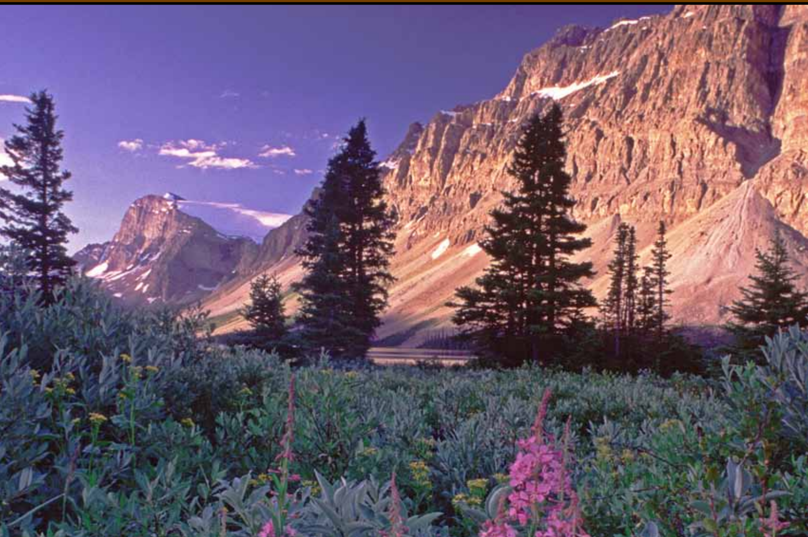
Fireweed and Crowfoot Mountain

THE ALBERTA WILDERNESS ASSOCIATION JOURNAL