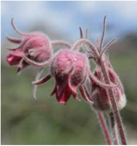
Three-flowered avens

to use our tripods as much as possible to avoid camera shake. Sometimes though the terrain would not cooperate and we could not set a tripod where we wanted it – then we simply rested the camera on