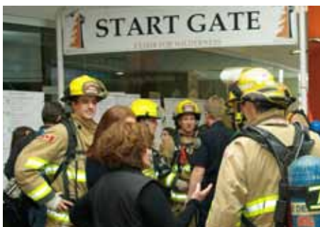
Calgary firefighters at the start of their climb

The amazing diversity of individuals climbing the tower's 802 stairs this year included everyone from highly trained and fit athletes to participants with handicaps who took on the challenge and made it to the top. Those who help with handicaps were there too, and two hearing dogs were part of the crowd in the stairwells. We are always thrilled to see our Calgary firefighters take on the challenge, and this year two teams of