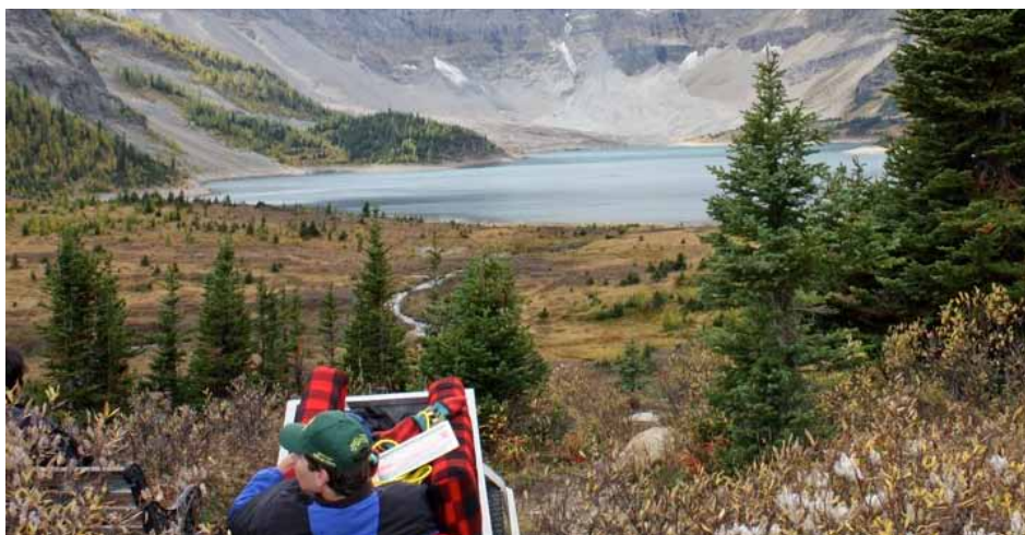
Lake Gloria at the foot of Mount Assiniboine

Innovative leaders and staff who are sensitive to the needs of disabled persons are valuable resources at a conservation area; they can make practical decisions that provide unique experiences or save the day if equipment breaks. Three examples from personal experience with equipment pop to mind. First, a quadriplegic wheel chair seat was necessary for a person to experience a sea kayak trip. The leaders found a way of wedging the special seat into the craft and a great afternoon experience resulted. In another case, a folding wheelchair could not be pulled and pushed over rough mountain trails. A two-wheeled aluminum luggage cart and camp furniture cushions saved the day on Mount Assiniboine British Columbia (see the accompanying photograph). Another example was to lash together two canoes with a wheelchair platform with tie-downs. My wheelchair-bound son experienced travel across a lake to