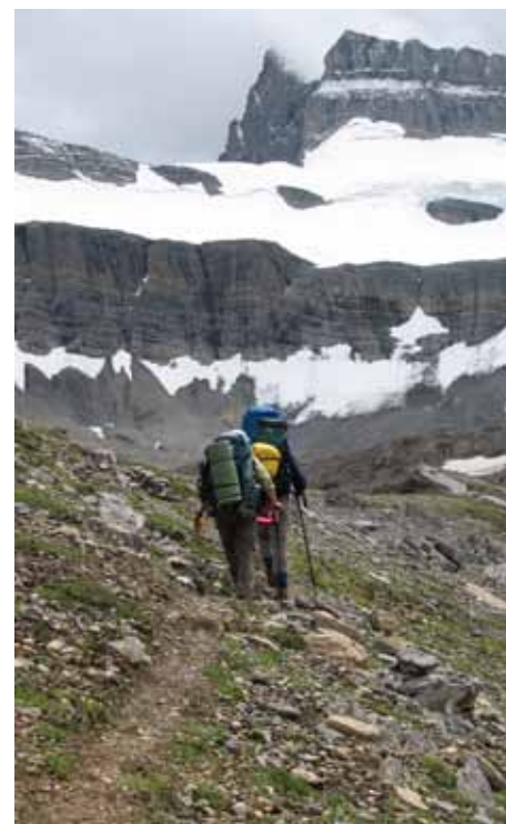
Hikers on the 2009 White Goat Wilderness backpack trip