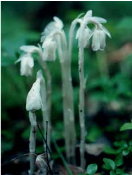
The rare Indian pipe