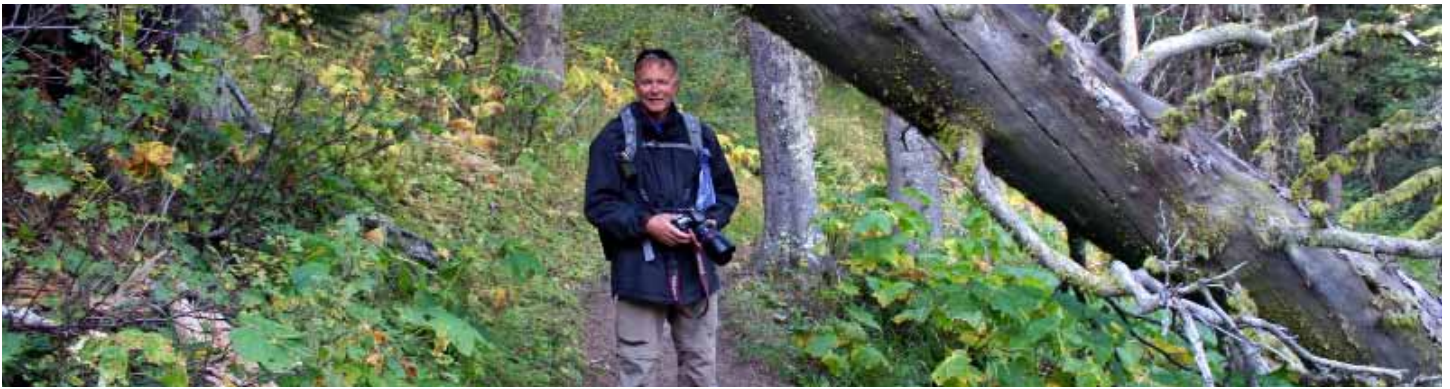
Hiking In Waterton National Park

corner or peek over that ridge right in front of me. In order to satisfy that curiosity I usually have to move my body from one location to another. After enough of this activity my body responds with that feeling of well-being – the release of endorphins – we associate with fitness. It is a great feeling to know that what you are doing will prepare you to do more of the same next week, next month, or next year. There might even be some long-term health benefits from all this outdoor activity!