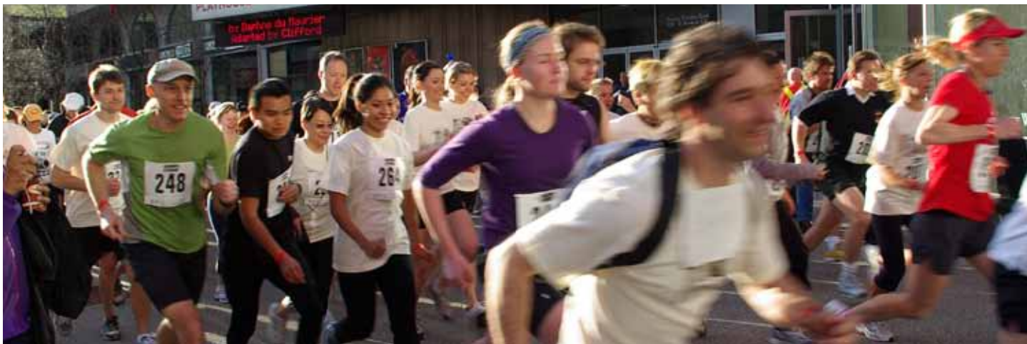
And they are off!