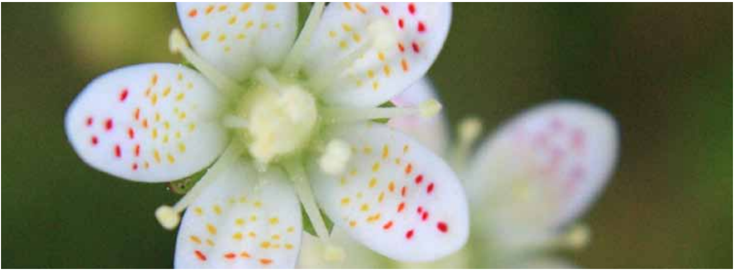
Spotted saxifrage

conservationists lead interpretive strolls, hikes, and horseback rides exploring Waterton's wildflowers.