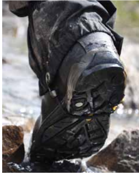
Stepping carefully across the Brazeau River

In the outdoors, especially the wild kind, thrilling discoveries await. They don’t happen routinely but just often enough to keep most of us motivated to keep looking and listening out there. “Intermittent reinforcement” is the term I learned in introductory psychology – I experience the same expectation of a bonanza that keeps a gambler at the poker