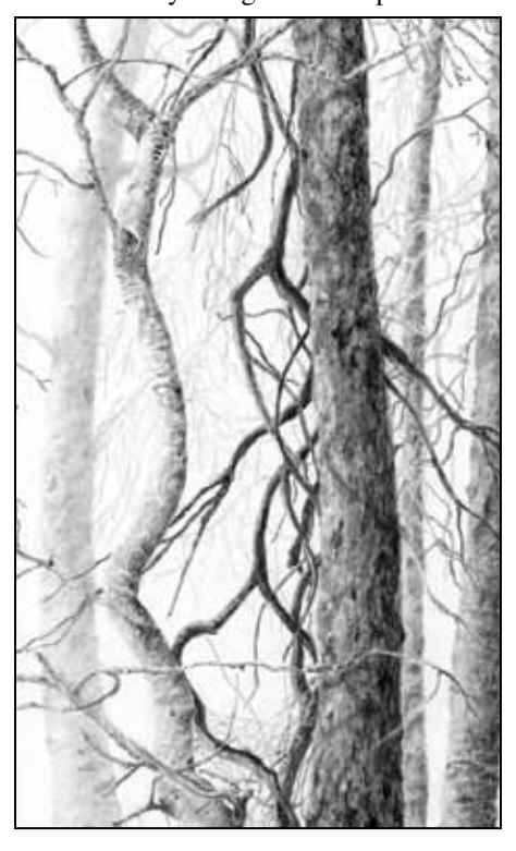
Trees of the Boreal Forest, Graphite, 28 x 36 cm © Joan Sherman

Apart from these legal requirements, the composition and functioning of the ESCC is wholly within the discretion of the Minister or the committee itself. Why might this be of concern from a species protection perspective? First, there is no legal requirement that members of the ESCC have any qualifications related to species conservation. While in practice ESCC members may be so qualified, there is no legal process by which to ensure this. Current members of ESCC include representatives from groups not commonly thought of as experts