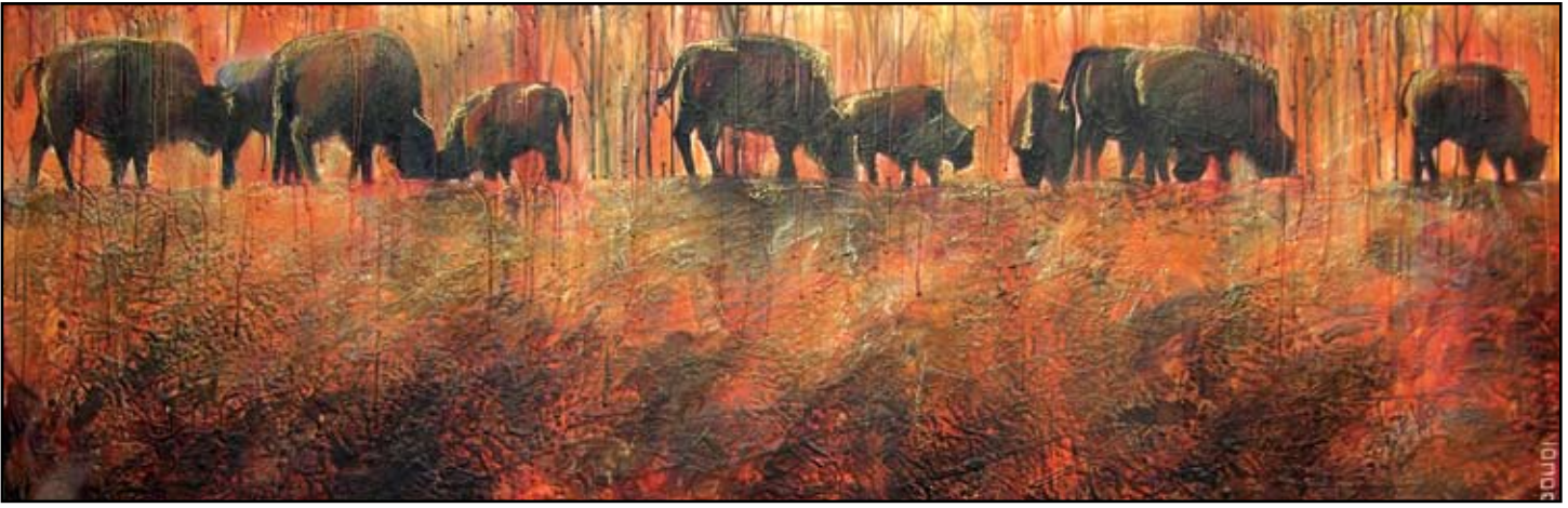
“Buffalo Roam” 80x28 inches, encaustic ©BIGOUDI

biodiversity of a rare ecosystem, it is likely to be considered invasive.