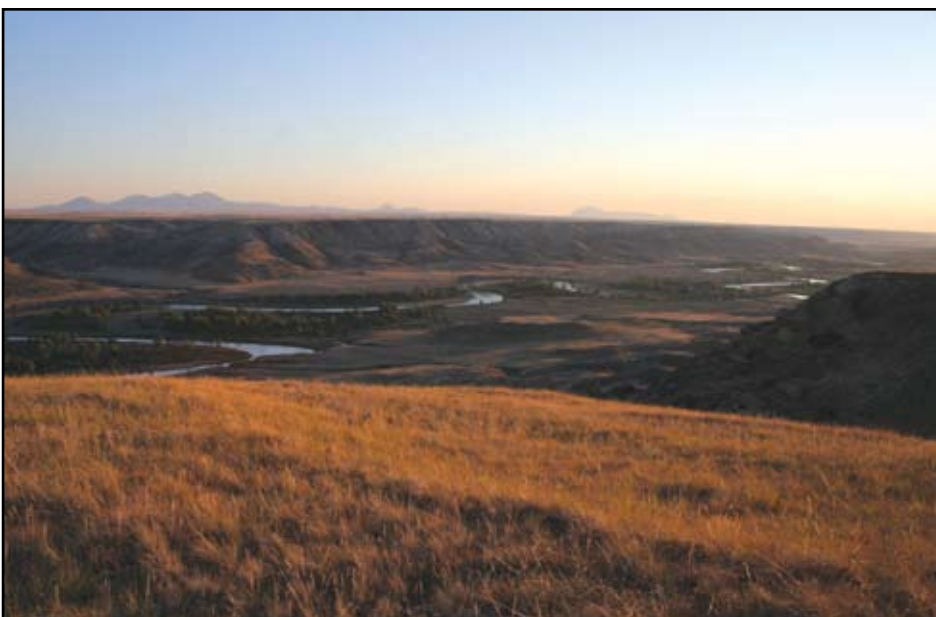
The Milk River Valley of southern Alberta is vulnerable to invasion by saltcedar ( tamarisk ), an aggressively invasive shrub that is considered a serious threat in the southwestern U.S. and has already reached northern Montana.

Not all non-natives are invasive. Some are invasive in some ecosystems but not in others. And some native species can take over and destroy the ecological integrity of their ecosystems. Humans are, of course, one species among many, but our linguistic and tool-using abilities mean that we have considerable control over our actions. We can minimize our impact on the earth if we choose to, or we can create conditions for the continued homogenization of the planet – ultimately to the detriment of most species, including our own. It’s up to us. 🍌