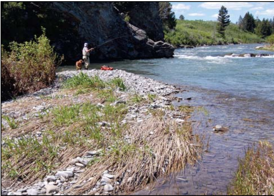
Reed canary grass along the Crownsnest River in southwestern Alberta. High flows scour riparian vegetation, sometimes removing riparian weeds, but the seeds, shoots, and roots of many weeds are also flushed downstream, allowing expansion along the river corridor.

rapid clonal expansion, which allows it to quickly dominate an area. While cattle or native ungulate grazing pressure may restrict reed canary grass expansion, it often alters the plant community of riparian zones, producing a number of ecological impacts.