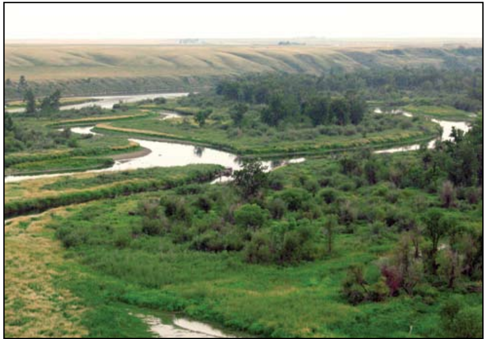
The blue-ribbon section of the Bow River below Calgary (at Carseland). Now dominated by large non-native rainbow and brown trout, this reach once held some of the largest native bull trout and westslope cutthroat trout in the province.

What have been the consequences? Well, on the positive side, Alberta anglers can now catch two additional fine species of trout. Brook trout are extraordinarily colourful fish, are prolific, often spawn successfully in lakes with minimal or no surface outflow or inflow, and are easy to catch. Brown trout can sustain considerable angling pressure (good!),