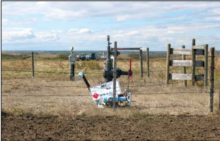
Disturbances such as this wellsite in Rumsey Natural Area are a clear invitation to the invasion of non-native species.

think. Most Canadian crops and garden species, for example, are non-native and have been intentionally introduced for economic or aesthetic reasons. Ladybugs and other insects are brought in for biological control of so-called pests, worms for waste management and bait, and animal species for food, pets, and recreational hunting and fishing. Wild boars, for example, were brought from Europe to Alberta game ranches in the early 1990s and some escaped. Since they produce 12 or 13 young per litter twice a year, they rapidly proliferated; in May 2008, the government officially listed the wild boar as a provincial pest, giving anyone the right to do away with them. Some domestic pigs have escaped from farms in Alberta and are adapting to the wild, even changing their physical appearance and growing tusks.