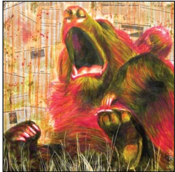
“Can’t bear it #3” 48x48 inches; newsprint, oil pastel & encaustic ©BIGOUDI