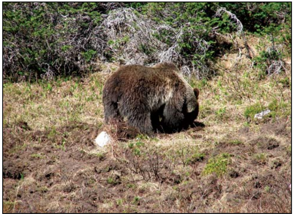
A grizzly bear minding his own business in the Highwood area of Kananaskis Country.