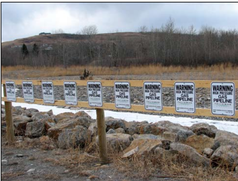
Many concerned Albertans are depending on the final Land-Use Framework document and its implementation to slow down landscape disturbance, now at an all-time high in the province.

Not all introductions can be avoided, but early detection and rapid response can prevent new species from becoming invasive and is much more cost-effective than long-term control. Important information about incipient harmful species can be gleaned from observant amateur naturalists as well as trained scientists. Systems of detection and response must be designed and coordinated among the various levels of government. Detection and rapid response may include following a protocol for prioritizing harmful species control projects, limiting spread through eradication and suppression, and expanding information-sharing opportunities.