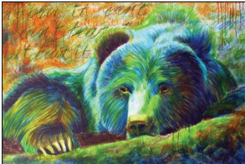
“Can’t bear it #2” 72x48 inches, oil pastel & encaustic ©BIGOUDI