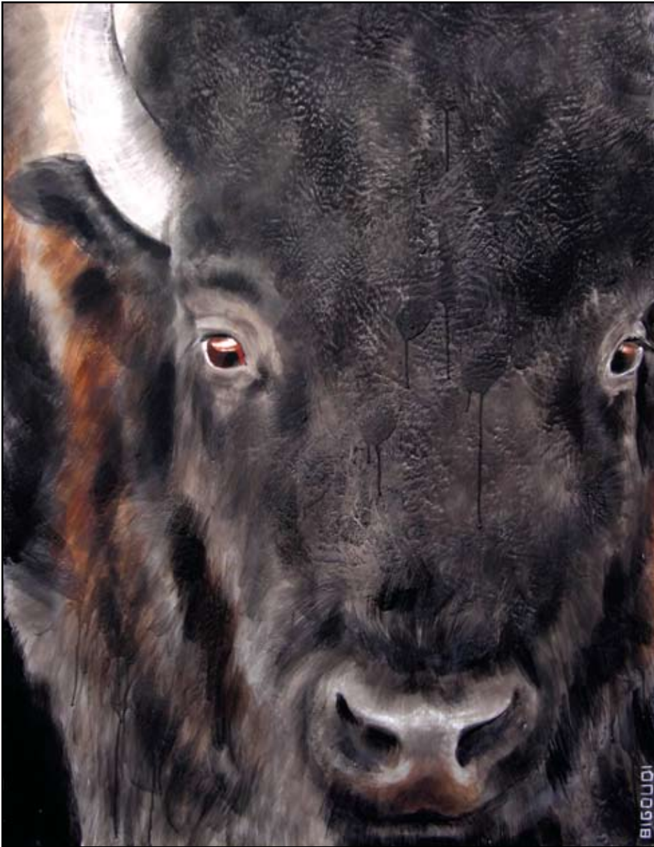
“Un Bison en Avril” 36x48, encaustic ©BIGOUDI

increases, which can negatively affect water quality and aquatic habitat. New trails add to the linear disturbance of wildlife habitat and the noise can result in territory abandonment and lost reproduction in some species. With these many impacts, it is important that we carefully consider where to permit motorized recreation in the province and not allow it to continue or arise in ecologically sensitive areas, in places that are protected by legislation or policy for the maintenance of the environment, or at the expense of important wildlife or watershed values.