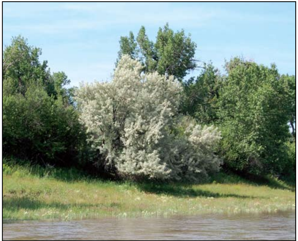
Russian olive near the junction of the St. Mary and Oldman rivers, near Lethbridge. This drought-hardy, introduced tree is popular for landscape plantings in Alberta's prairie regions but can subsequently expand along river valleys as the large seeds are dispersed by birds.

Another attempt to control leafy spurge was through herbicides. However, chemical control is especially difficult in riparian zones since these are adjacent to surface waters that shouldn't be polluted. The irregular terrain of riparian zones precludes the use of large spray machinery, and the use of backpack-mounted herbicide sprays is very expensive and prone to chemical drift