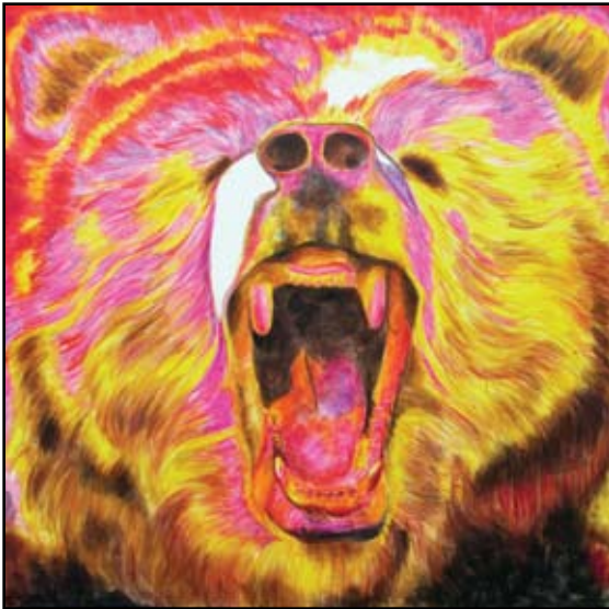
“Can’t bear it #1” 57x57 inches, oil pastel & encaustic ©BIGOUDI