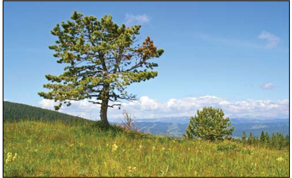
The limber pine (Pinus flexilis) thrives in harsh, windswept conditions, such as on this hillside in Alberta's Porcupine Hills. An invasive non-native fungus, white pine blister rust, is partly responsible for the decline of limber pine throughout most of its range in Alberta.

Limber pines, which can grow to be a thousand years old, are the stately ridge-top giants so typical of areas such as the Whaleback or the Porcupine Hills. Also found in southern Alberta are huge old whitebark pine trees, whose copious quantities of high energy seeds provide a vital food source for grizzly bears in some areas. They are also notable for