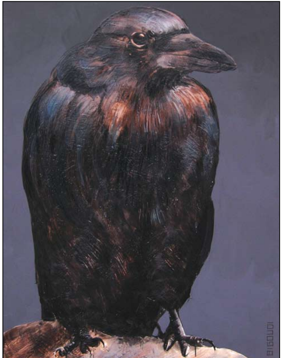
“Raven” 36x48 inches, encaustic ©BIGOUDI

that its projects have harmed the lake. Furthermore, federal and provincial government agencies, who were signatories to the international treaties, have abrogated their responsibility to protect the lake from mismanagement. They, as well as the local birdwatching community, seem to have shrugged the problem off. Hesitant to criticize a highly regarded organization such as DUC, they simply place the blame on the regional drought and global warming.