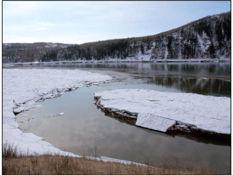
The Peace River valley near the site of the proposed Dunvegan dam. The valley provides some of the last intact parkland habitat in the region.