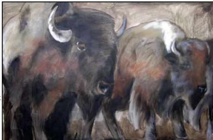
“Prairie Movement” 60x40 inches, encaustic