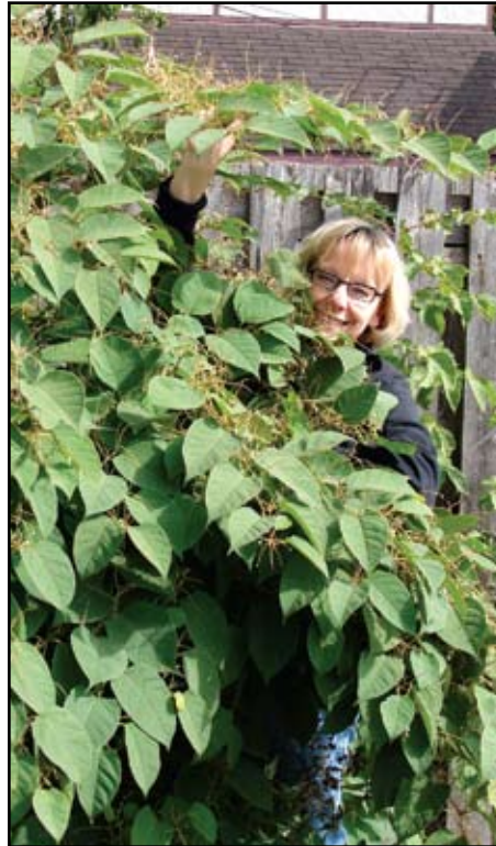
The author, pictured here with the highly invasive Japanese knotweed.

Because of the choice of plants designated as weeds, the strong powers of the Act fall short in that they are used in a reactive rather than preventive way to address invasive plants. The current Weed Regulation and relevant municipal bylaws are oriented to agricultural and urban weeds (e.g., Canada thistle, sow thistle) and invasive plants that have already become widely established (leafy spurge, purple loosestrife). Other plants that are highly invasive in some parts of Alberta or only starting to become invasive throughout the province (Russian olive, baby's breath)