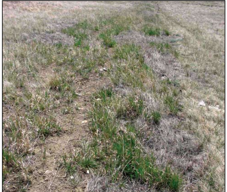
Spring 2008 – bright green tufts of crested wheatgrass are growing through vegetation killed with herbicide along a recently constructed pipeline in the Rumsey Natural Area.

Southern Alberta's moist, loamy soils are similar to those in Europe and Asia, where crested wheatgrass ( Agropyron cristatum ), smooth brome ( Bromus inermis ), and Kentucky bluegrass