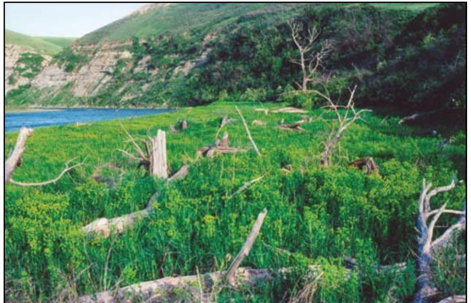
Remnant trunks beside the St. Mary River near Lethbridge provide evidence of a narrowleaf cottonwood grove prior to the 1951 implementation of the St. Mary Dam, which led to severe reductions in the summer flows below the dam. While the cottonwoods and willows collapsed, leafy spurge invaded and is now the dominant plant in many locations below the dam.

In Alberta, as elsewhere, riparian areas are also chosen for livestock production, especially cattle. The cattle trampling provides yet another disturbance that can further weed invasion. Cattle browsing can amplify weed problems since cattle preferentially graze some species, often native plants, while weeds such as thistles are unpalatable, providing a competitive advantage.