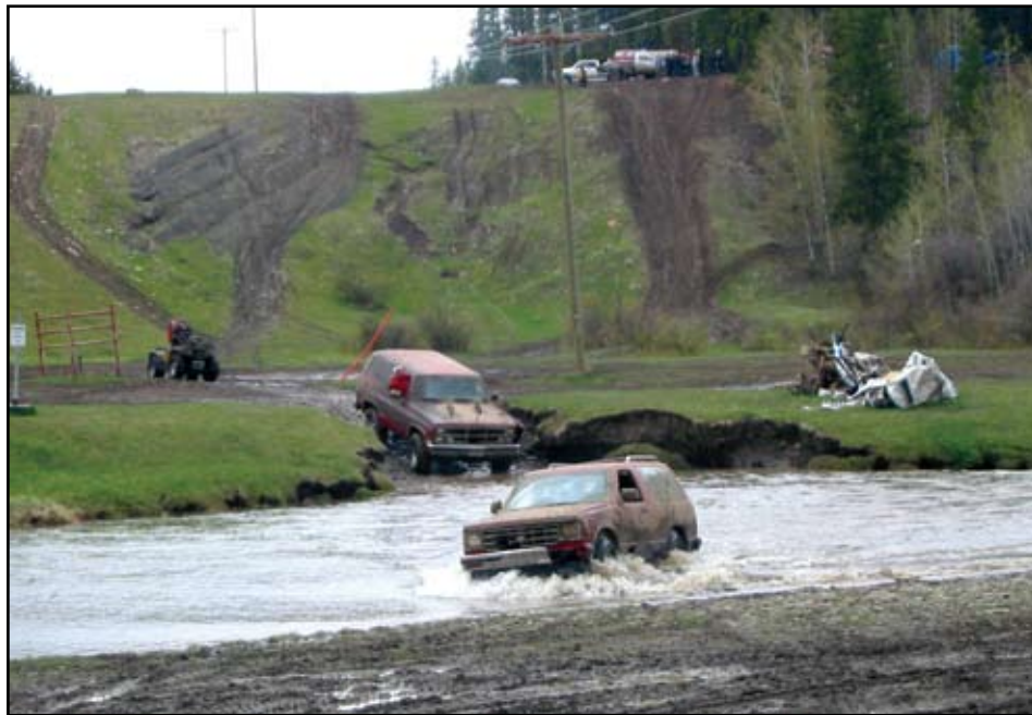
Government policy and regulation related to OHV use must be backed up with adequate monitoring and enforcement capacity to address the increasing impacts on our public lands and wilderness areas.

The public's response in the days following was almost as loud as the sound of engines in the woods that weekend. The destruction was on the tip of pens and tongues of local journalists.