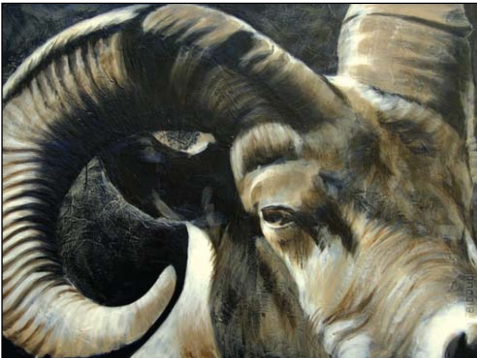
"Bighorn Sheep #1" 48x36 inches, encaustic