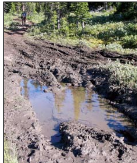
Monitoring OHV trail damage in the Bighorn.

AWA supports safe, responsible motorized recreation on designated trail networks in areas appropriate for that use. However, the damage caused by off-highway vehicles is well documented. OHV use can cause intense soil disruption through erosion, compaction, and sedimentation. Vegetative cover is destroyed and tree roots exposed. Invasive alien plant species can make their way into areas on a vehicle. Where OHVs cross creeks and rivers, siltation