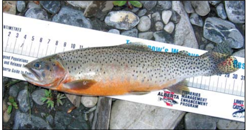
Examining external markings helps to identify the elusive genetically pure westslope cutthroat trout population. This fish may be from a pure or lightly introgressed population.