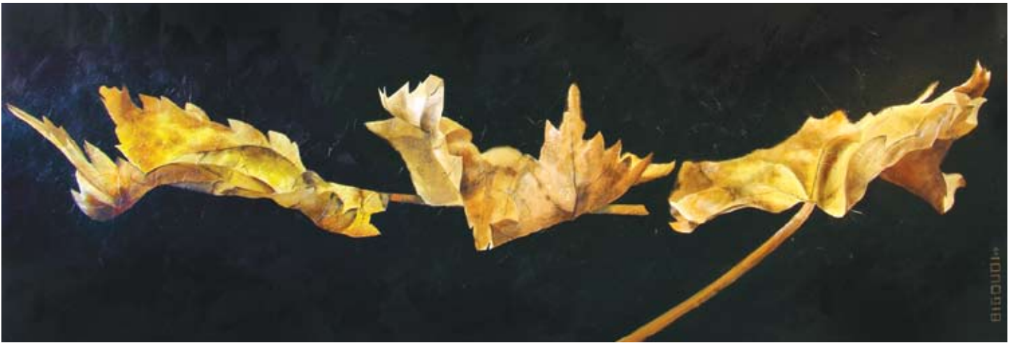
“Variations on the same leaf” 80x28 inches, acrylic ©BIGOUDI

Once non-native species are well-established, the only management option is often control of further spread and mitigation of impacts. Control methods may include cultural practices (crop rotation, hunting, fishing), removal (hand pulling, mechanical harvesting, burning, using herbicides and pesticides), interference with reproduction (sterilization), or biological control. Most scientists, however, will admit that we have barely scratched the surface in our knowledge of how ecosystems work, never mind the details about how each individual species functions. Based on such limited understanding, the best-laid plans for control can go badly awry.