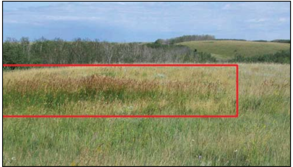
A patch of smooth brome (outlined) has invaded plains rough fescue grassland from a nearby wellsite in the Rumsey Natural Area.

The Rumsey Natural Area and Ecological Reserve (183.5 km 2 ), which straddles the Central Parkland and Northern Fescue Subregions, offers our biggest and best opportunity to check the advance of invasive agronomics into plains rough fescue communities. The extent of invasive species in the protected area has yet to be fully documented. Ensuring that native vegetation remains in good condition is the most effective way to prevent invasion of Kentucky bluegrass, smooth brome, and crested wheatgrass. Where these species already occur, control measures tailored to the