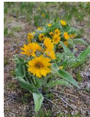
Balsam Root on the Whaleback

P.S. To see all of the great adventures from this year give us a follow on your favourite social media channel @adventures4wild . The links are also at the end of this newsletter.