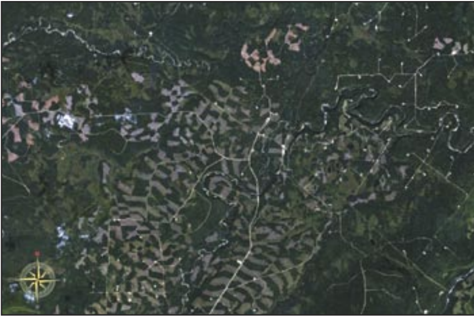
Cumulative effects west of Hinton

in intense discussion internally and with a number of environmental and landowner groups in the province.