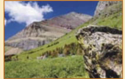
Table-top mountain in southern Kananaskis. Easy to moderate hike.