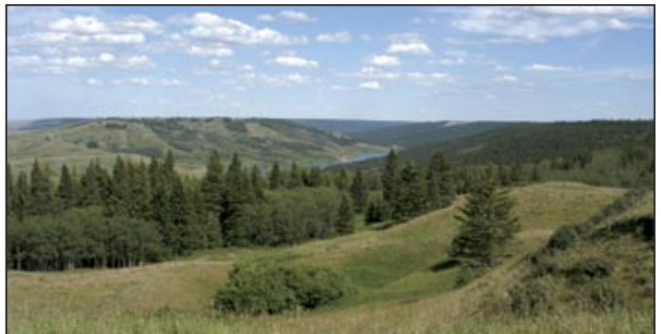
Cypress Hills Inter-Provincial Park exists as an island of protected natural environment within a sea of agricultural land use. The park is managed for protection of its native biodiversity, while surrounding lands are managed for agricultural productivity. These diverse management purposes result in problems such as elk depredation outside of the park. The Cypress Hills Elk Management Planning process was initiated to address the issue of elk depredation on agricultural lands outside of the park.