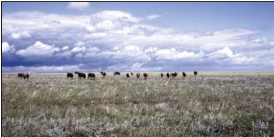
Cattle share the range with wild ungulates in the Cypress Hills. Cattle grazing is used as a management tool inside the provincial park to maintain range health. Outside the park, cattle graze on private pastures and on public land grazing leases. In the foreground is shrubby cinquefoil, a sign of overgrazing

The facilitator decided to focus on this issue. Early on in the process, leaving issues and interests behind, he trotted out a ranking tool consisting of three sets of factors, biological/