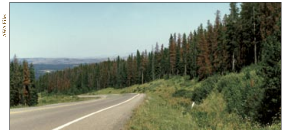
Beetle-killed pines in southwest Alberta during a 1980s outbreak.

The hyperbole about pine beetles leads us to imagine a beetle outbreak being like a forest fire, sweeping through and devastating everything in its wake. But of course MPBs mostly affect pine trees over 50 to 60 years of age, leaving behind spruce, fir, deciduous trees, all the undergrowth – and healthy younger pine trees.