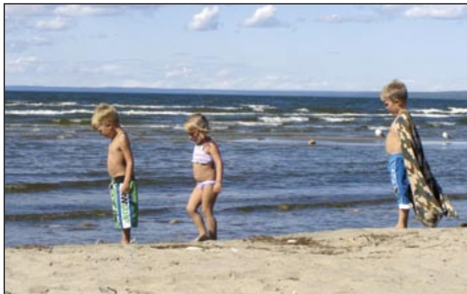
Inheritors of Alberta's water legacy frolicking on the shores of Lesser Slave Lake.

Although AWA believes firmly in public involvement in government decision-making, these invitations by government are generally made in the