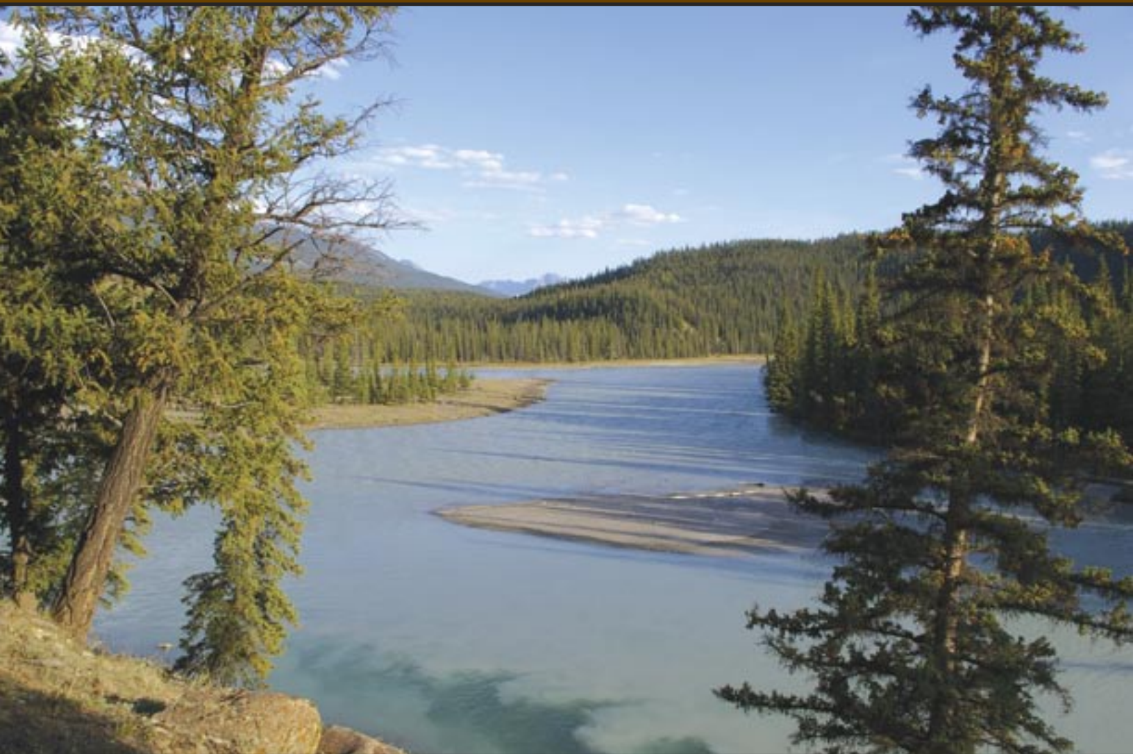
The Athabasca River in Jasper National Park

THE ALBERTA WILDERNESS ASSOCIATION JOURNAL