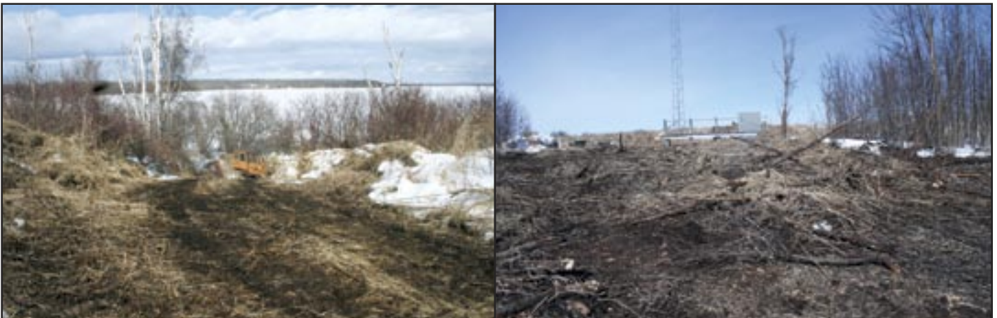
These were some of the photos sent by local naturalists to Minister Hector Goudreau to show the damage done to the island. Left: The road created during the installation of the communication towers in High Island Natural Area in Lac La Biche. Right: The cleared area at the top of the island for the erection of the taller of the two towers that the government installed, presumably to monitor bird activity on the island.