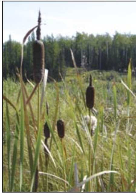
Wetlands near the Athabasca River. A new Wetlands Policy, one of the projected outcomes of the Water for Life process, has been bogged down in controversy.

Some of the half-dozen or so WPACs (Environment Minister Renner mentions 15, but only five are listed on the Water for Life website) evolved