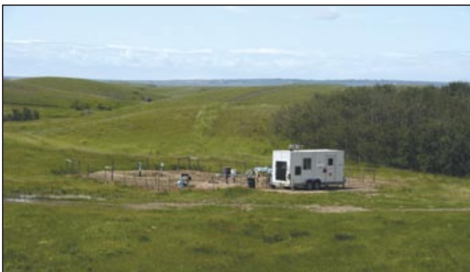
A conventional well site by Pioneer Natural Resources in Rumsey Natural Area. Well operations on this particular day were extremely noisy, making for unpleasant conditions for those on a public field trip to this piece of Wild Alberta.

On March 17, 2006 a Memorandum of Understanding: Management and Issuance of Land Dispositions on WAERNA and Provincial Park Lands was signed