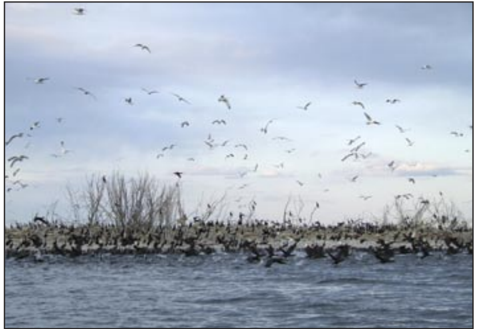
High Island is a federally designated Bird Sanctuary, a Provincial Wildlife Sanctuary, and a nominated Important Bird Area. This rocky shore serves as a nesting area for gulls and cormorants.