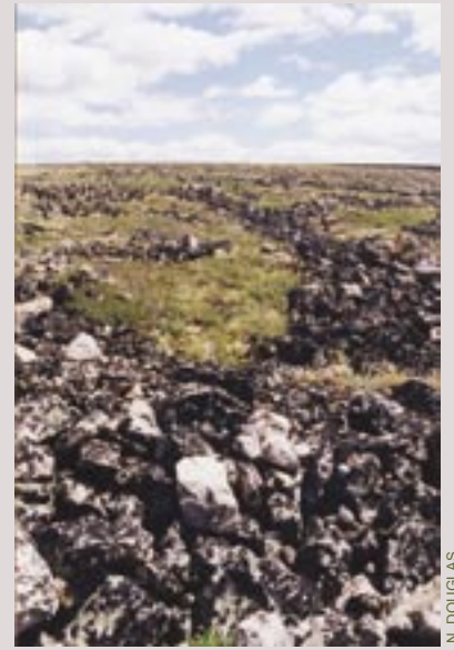
SORTED STONE CIRCLES